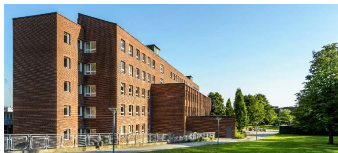
Figure 1. The A-building in Lund, Sweden.

The investigation concerns the building hosting the Department of Architecture and Built Environment at Lund University in Lund, Sweden. The building, constructed in 1965 and designed by Klas Anshelm, is a five-storey brick building connected to a district heating system.