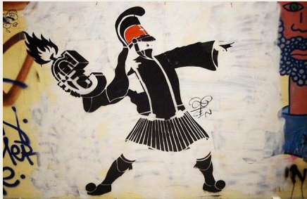
Figure 2 Exarchia, Athens (street artist: Absent)