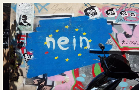
Figure 5 Metaxourgeio, Athens (street artist: N_Gram)