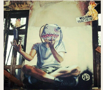
Figure 6 Exarchia, Athens (street artist: WD)