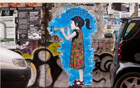
Figure 3 Monastiraki, Athens (street artist: Bleeps.gr)