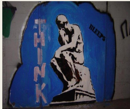
Figure 4 central Athens (street artist: Bleeps.gr)