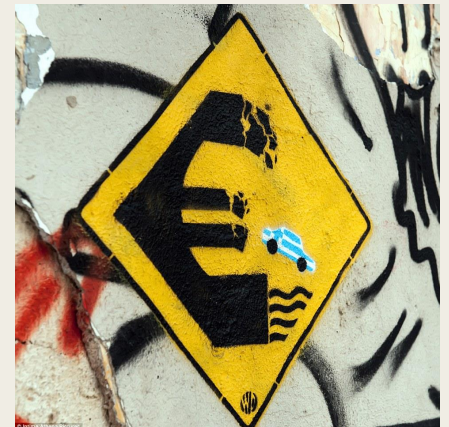
Figure 7 Psiri, Athens (street artist: WD)