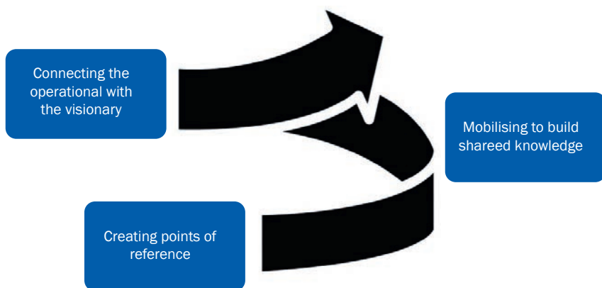
Figure 2: Steps in the iterative process

STINT's document on responsible internationalisation provides guidance to Swedish HEIs by identifying several aspects in which greater accountability is necessary. The document refers to the broader range of interests and challenges that an internationally active HEI must consider at present and in future. This report has highlighted different experiences of addressing such issues and indicated possible focus areas for HEIs, depending on their current situations. Below we suggest an organisational model for systematic responsible internationalisation that aims to develop the capacity of staff and the organisation to recognise and handle the complexities of internationalisation. This iterative model suggests creating points of reference (concrete examples) that may form the basis of specific projects aimed at connecting organisational and strategic aspects. Experiences of such projects contribute to fostering preparedness and a forward-looking approach at all organisational levels (Figure 2).