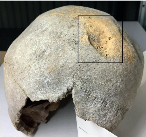
Fig. 2. Healed blunt force trauma (c. 30 x 18 mm) to the posterior portion of the right parietal.