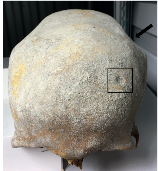
Fig. 3. Clear biparietal thinning with significant sloping of both parietals. Note the healed pond fracture (c. 7 x 8 mm) on the left frontal.

iliac joint (Lovejoy et al. 1985) corresponds to phase 8 and an estimated age of 60+ (Tornberg unpublished). The teeth of the individual were also heavily abraded, and signs of pulp infections were present for three teeth. The right mandibular second molar was lost antemortem.