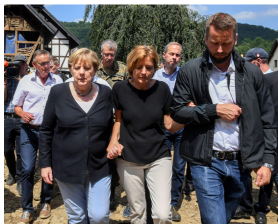
German Chancellor Angela Merkel and Rhineland-Palatinate State Premier Malu Dreyer (C) talk as they visit the flood-ravaged village of Schuld near Bad Neuenahr-Ahrweiler, Rhineland-Palatinate state, Germany July 18, 2021.

“ Extreme heat and elevated night time temperatures cause significant physical and mental health impacts. ”