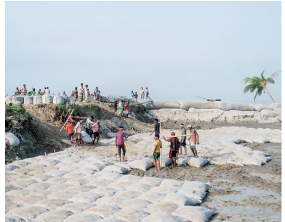
Sandbags being laid for the foundation of a river bank defence, at Elisha Ferry Ghat, on the bank of the Meghna river on Bhola Island, Bangladesh where as much as 18% of the countries land mass could be inundated by sea level rise.

It is essential to distinguish between direct and indirect impacts. NELD may be directly linked to an adverse climate impact, for example, when a cultural site is lost to wildfire. They can also occur indirectly, for example, when malnutrition is experienced as a consequence of the loss of crops due to drought 22 .