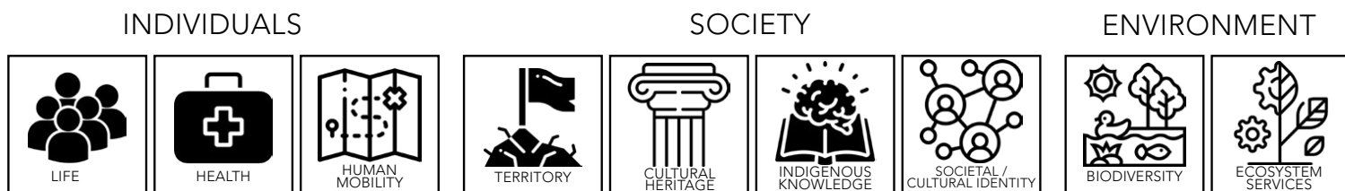
Figure 1: UNFCCC non-economic loss categories

NELD impacts individuals, societies, and the environment. Figure 1 outlines the UNFCCC’s categories of non-economic losses. While these nine categories are instructive, researchers have identified far more ways to experience loss 5 , drawing from over 100 case studies from around the world that show how the things that people value can be eroded or obliterated from their lives. Examples ranged from NELD to traditions and culture, to physical and mental health, to sense of place and social fabric, and to identity and dignity. Given the almost infinite number of different ways people assign value to things, capturing all types of NELD is immensely challenging. Despite this, it is imperative that assessments of L&D ensure that there is coverage of the non-economic dimensions. Failing to do so can distort our understanding of climate change impacts, discount and exclude the experiences of some, and skew future decision-making 6,7 . Examples 1 and 2 further illustrate the concept of NELD.