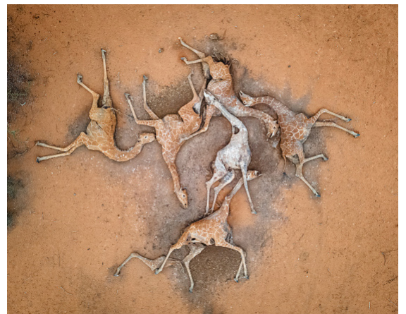
The bodies of six giraffes lie on the outskirts of Eyrib village in Sabuli Wildlife Conservancy in Wajir County, Kenya in December, 2021. A prolonged drought has created food and water shortages for the regions wild life, pastoralist communities and livestock.

“ NELD is already occurring, all over the world. ”