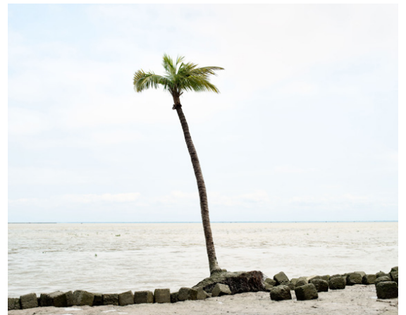
Lone palm tree atop of a coastal defence destroyed by Cyclone Aila on the bank of the Meghna river on Bhola Island in Bangladesh.

“ Non-economic loss and damage refers to the things of value—intangible or tangible—that are not commonly traded in markets. ”