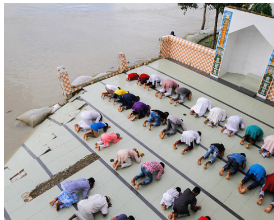
Eid al-Adha prayer is performed in a flood affected area near Dhaka, Bangladesh, during monsoon floods that displaced upto 1.1 million people in 2020.

McNamara et al. 9 explored approaches that can be used to address NELD in the Pacific Islands. Preferred approaches included education and training to create awareness and understanding, documenting Indigenous and local knowledge, and engaging with the natural environment. Communities that are already experiencing climate-related hazards have also created practices for addressing NELD. Van Schie et al. 53 explored how communities in Southwest Bangladesh are currently addressing NELD with observed