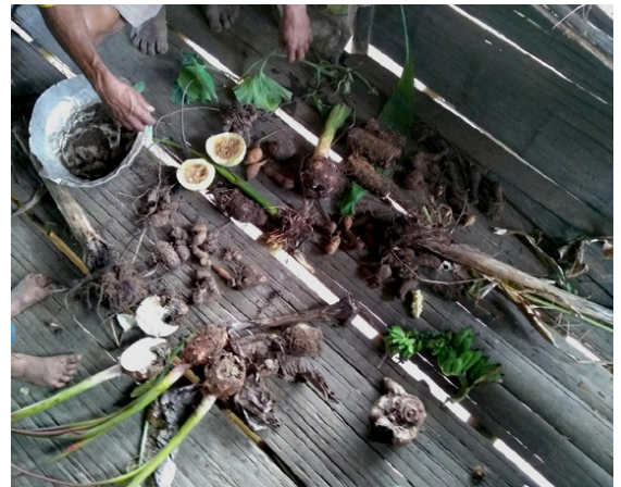
While a variety of factors wreak havoc on subsistent food systems in the Bedamuni tribe of Western Province, Papua New Guinea causing loss and damage to critical food crops, changing local climatic conditions such as precipitation regimes have increasingly had the most impact.

“ Entire ways of life collapse when the material manifestations of deeply grounded Indigenous knowledge, science, and philosophy are deleted by the effects of climate change. ”