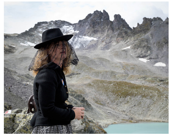
A woman takes part in a ceremony to mark the 'death' of the Pizol glacier (Pizolgletscher) on September 22, 2019 above Mels, eastern Switzerland.

As early as 1991, when the UNFCCC was being drafted, the Alliance of Small Island States (AOSIS)—a negotiating group of small island nations facing the worst climate change risks—highlighted the need to address L&D for vulnerable countries. At the time, the group proposed establishing an international insurance pool that could, for example, compensate victims of projected sea level rise, But the idea was rejected. It took another 16 years for L&D to be included in a formally negotiated UN text (the 2007 Bali Action Plan ).