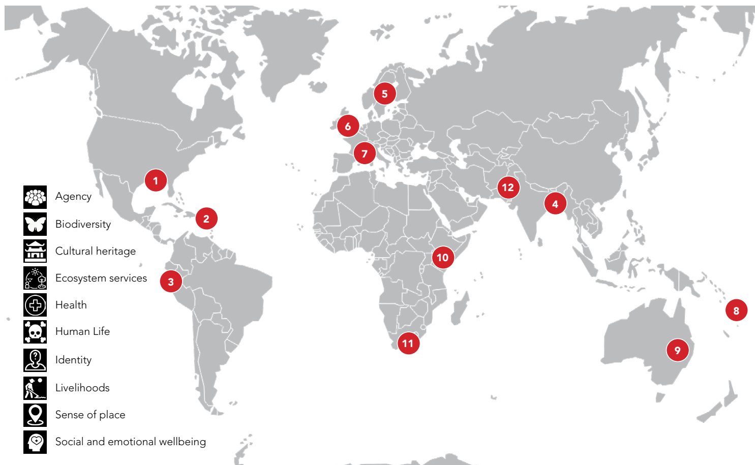
Figure 2: Examples of climate change-driven NELD around the world (adapted from Boyd et al., 2021 and reproduced with permission). 3