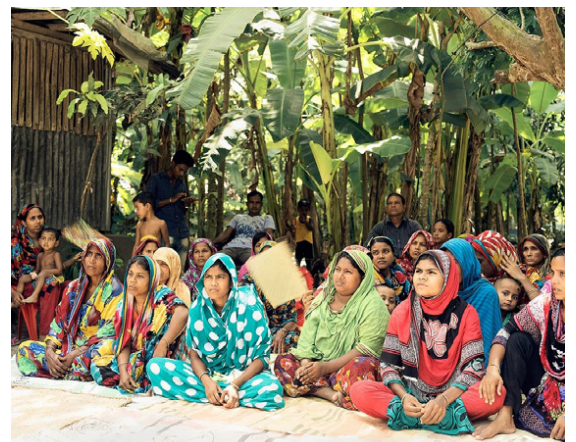
Cyclone disaster preparedness courtyard meeting in the village of Dalbanga South, Bangladesh, which was hit hard by category 5 Cyclone Sidr in 2007. In Bangladesh, women are the most likely to be killed or injured during a cyclonic event, due to their socially constructed roles which make it harder for them to leave their homes and livestock without the permission of their husbands for fear of stigma.

“ Gender can significantly shape experiences of NELD. ”