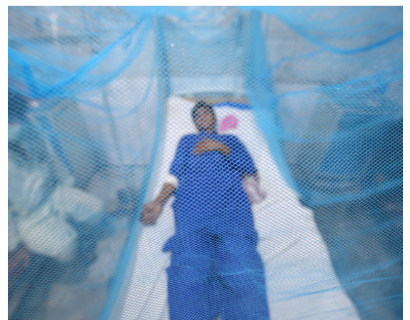
A patient suffering from dengue fever receives medical treatment at an isolation ward of a hospital in Karachi, Pakistan, 04 October 2022. The unprecedented flooding in Pakistan has led to outbreaks of diseases such as diarrhea, dysentery, dengue fever and malaria.

“ Whilst current NELD must be addressed and compensated today, minimising future NELD must be a priority. ”