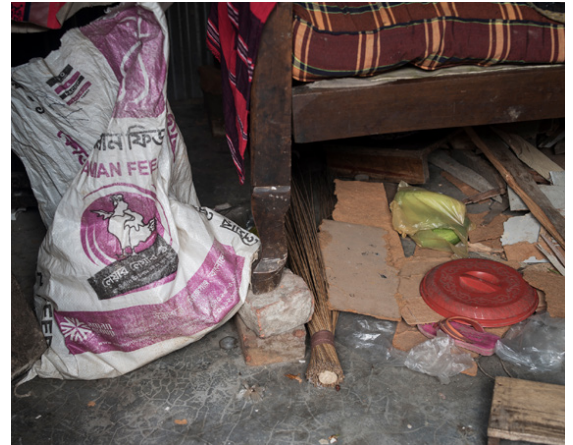
Bricks placed under a bed frame by a family living in Kallyanpur Basti, in Dhaka Bangladesh, to avoid getting wet at night when flooding occurs. Being continuously immersed in dirty water can lead to the development of skin conditions which can lead to infection.

“ Indigenous people are more exposed to NELD due to marginalisation and exclusion. ”