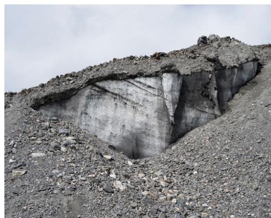
The Imja-Lhotse Shar Glacier in Soukhumbu, Nepal, is one of the glaciers experiencing the highest rate of loss in the Mount Everest region.

“ The earth has entered a dangerous new era of climate impacts now that global warming is reaching 1.1°C above pre-industrial levels. ”