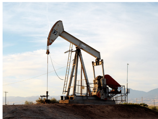
Holms Western Oil Corporation, Pump Jack Number 13, Midway-Sunset Oil Field, Pentland Road, Maricopa, Kern County, California, USA.

Vulnerability is much higher in Least Developed Countries, but it can be high in all developmental contexts. Those particularly marginalised in affluent countries should be acknowledged in NELD discourse going forward 16 . While NELD is a universal phenomenon, it is not experienced equally. In this sense, NELD is potentially a powerful