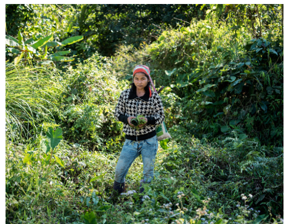
A woman from the Khmu minority ethnic group picking greens in community forest at Ban Tha Se, Luang Natha Province, Lao People’s Democratic Republic. Longer dry seasons and drought are leading to food insecurity.

“NELD requires interdisciplinary research that is sensitive to the multiplicity of worldviews, ethical systems and values people hold.”