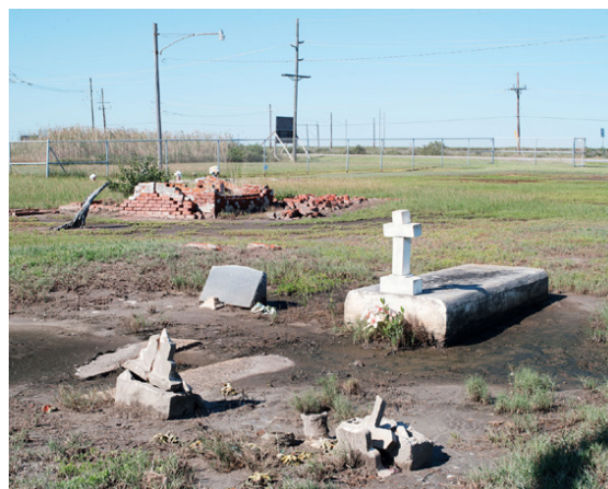
Sea level rise, saltwater intrusion and subsidence is causing the Cheniere Caminada Cemetery on Grand Isle in Louisiana, USA, to sink leading graves to list, collapse and sink into the ground.

“ The value of NELD is highly subjective and incommensurable. Items or feelings can hold different values among cultures or even individuals. ”