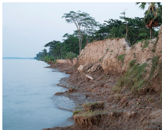
In the village of Dalbanga South in Bangladesh, cyclones have caused fatalities, whilst riverbank erosion has destroyed heritage sites and saltwater intrusion has impacted livelihoods affected the health of the community.

NELD are occurring all over the world (Figure 2). Yet, NELD are being disproportionately experienced by those in the Global South due to a range of historical, geographic, structural, and socio-political factors. Moreover, the NELD experienced by different people in different places is highly context-specific and influenced by intersectional identities, values, and lived experiences. We start with one example from the Global South and North to illuminate the context-specific nature of NELD.