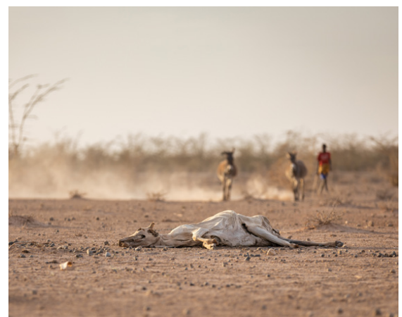
The ongoing drought in East Africa has led millions of people to face extreme hunger and left many on the brink of famine as livestock have died and crops have failed.

“NELD may be directly linked to an adverse climate impact, for example, when a cultural site is lost to wildfire. They can also occur indirectly, for example, when malnutrition is experienced as a consequence of the loss of crops due to drought.”