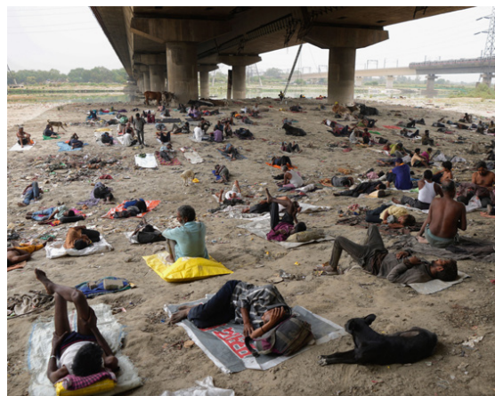
Homeless people sleep in the shade of an overbridge in in New Delhi. At least 2,000 people died in India during the heat wave in 2015, when temperatures hovered near 50 degrees C. In Pakistan in 2022, the death toll stood at 1,200, with some local estimates putting it at around 3,000.

Major flooding occurred in Germany, Belgium, the Netherlands and Luxembourg between 12-15 July 2021 31 . World Weather Attribution ascertains that there is high confidence that human-induced climate change increased the likelihood and intensity of this flooding 32 . No studies have yet calculated the full range of NELD. However, 200 people died 33 and a significant loss of crops and grain quality was reported 34,31 . Economic losses are estimated to be €3 billion 31 . There was widespread coverage of the emotional toll of the flooding. In particular, this related to the trauma of those who experienced the floods, those who were evacuated, those who lost loved ones, and those whose missing loved ones’ bodies were never recovered 35 . Belgium declared a day of mourning 36 and one political commentator said that “the impact on the total economy stands in no comparison with the human suffering” 37 . All twelve residents on the ground floor of a German care home were trapped and drowned 38 . The health system and early warning systems did not manage to protect this group, demonstrating that different groups experience NELD in different ways based on intersectional marginalisation. In addition, many people lost their homes and all their belongings which brings a range of intangible and emotional losses 37,39 , as well as the loss of things with