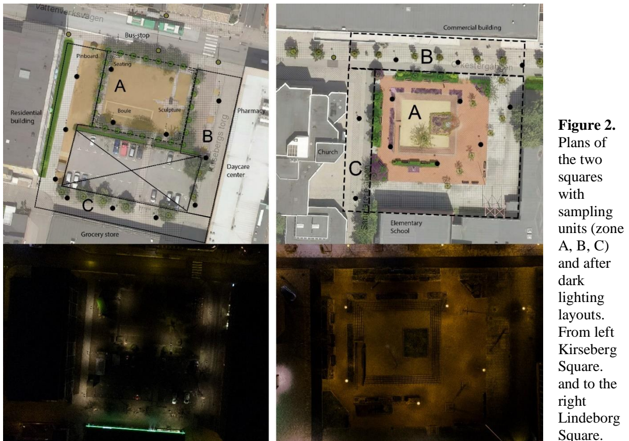
Figure 2. Plans of the two squares with sampling units (zone A, B, C) and after dark lighting layouts. From left Kirseberg Square. and to the right Lindeborg Square.

as a ‘social’ area with seating, B is a pedestrian and cyclist path with access to commercial shop(s) and other services(s) and C is a path linking the surrounding residential areas of the neighbourhood to its local square. A sampling session of 45 min enabled 3 rotations between the sampling units, with one rotation every 15 minutes always starting in sampling unit A, continuing to B and hereafter to C.