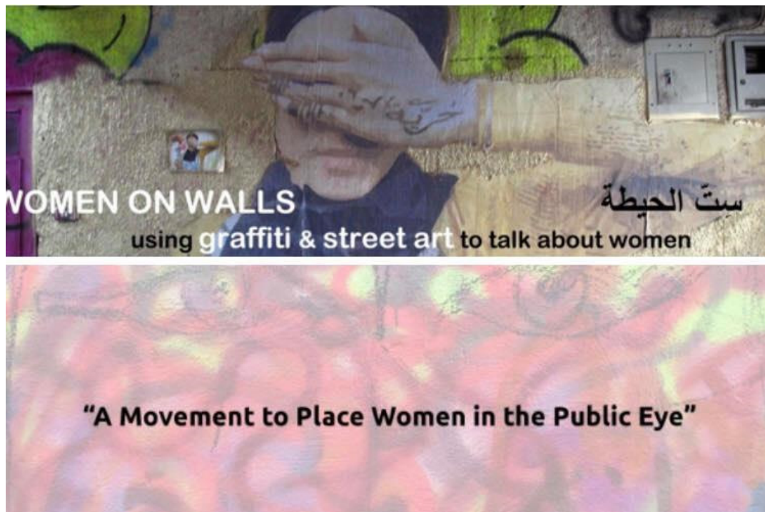
Figure 9. WOW (2018)

WOW spearheaded many campaigns, including the project in Cairo with 30 artists and other campaigns in MENA countries that included 60 streets. WOW was funded by CKU (The Danish Centre for Culture and Development). WOW worked with many local NGOs, such as feminist groups like Nazra, to advise WOW on how they would represent women's issues through graffiti.