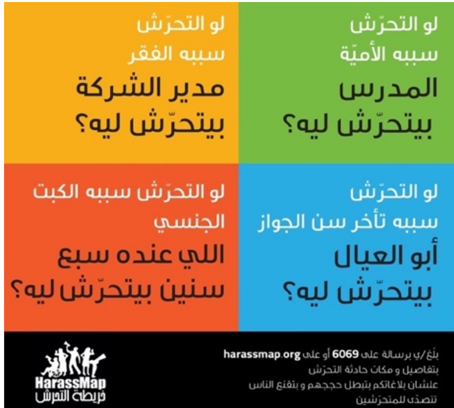
Figure 4. HarassMap (2018)

An emerging pattern in the two initiatives and other initiatives I visited, for example, the Bassma initiative, was that men directed these new forms of action-oriented activism groups and many men volunteers participated. This interesting information suggests that SH was a concern for women and men who were tirelessly combating SH. This pattern corresponds with the aforementioned reports of many men who supported women in 6AYM, OPPs, and later in the graffiti group, showing a feminist consciousness but without a feminist organisation. Indeed, Nevine Ebeid (NWF) asserts that,