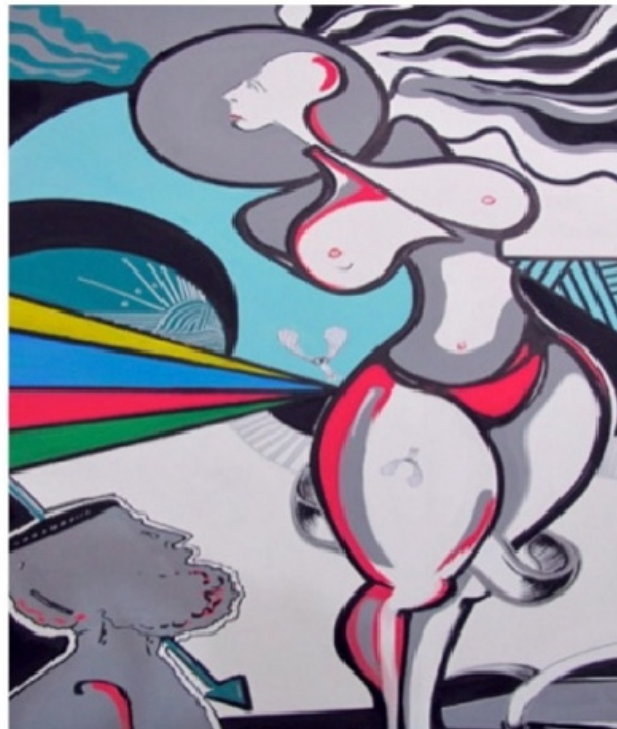
Figure 11. WOW (2015b)

First, disclosing the sensual private feminine items questions sexuality in what society perceives as private. In her graffiti, Nour (WOW, 2015b) symbolically depicted a naked female body that people perceive as taboo to open the space for public discussion about sexuality. She called her graffiti 'There is no shame' (Figs. 11–12). She noticed a man looking at her lustfully and intrusively, as if she were an object or something that would give pleasure.