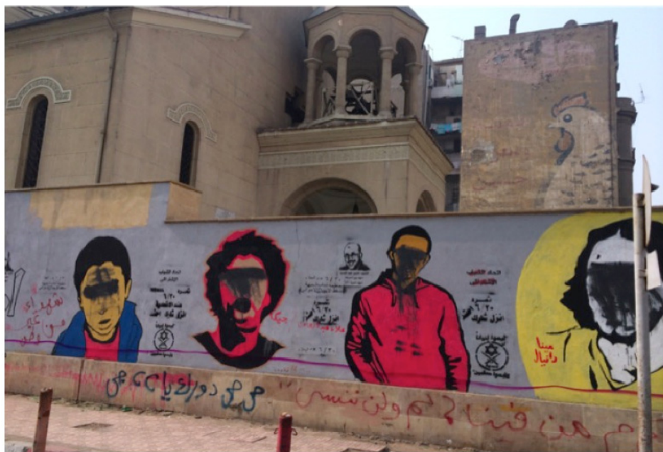
Figure 15. Author's own photograph (2014)

From my observation, I saw a lot of graffiti on the walls of a church in downtown Cairo in 2014. Some people intentionally defaced this graffiti. I think that this defacing was not done by a bunch of messy and inconsiderate people because they only destroyed the eyes of those portrayed. There was a message that it was El-Sisi's turn, hastily drawn but left alone. There was an announcement for apartments and houses. A few other things I could not really make out, but the layers turned the wall into a space of contestation between different political actors. The graffiti depicted the martyrs of the Maspero Massacre in October 2011, including Mina Danial, a Coptic Christian activist who was killed in the Maspero protests. This situation suggests that they would hide the identities of these portrays on the walls (Fig. 15).