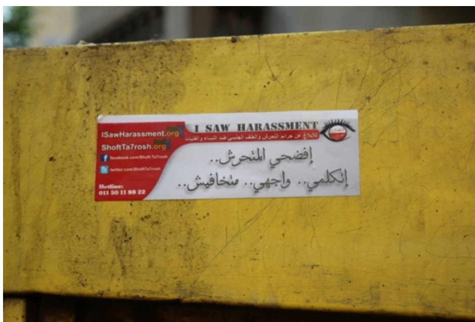
Figure 7. ISH (2018)

On the other hand, one of ISH’s main strategies was to encourage women not to remain silent. For example, the leaflets the initiative distributed on the streets (Fig. 7) read in Arabic, ‘Expose the harasser ... Speak out ... Confront ... Do not be afraid’.