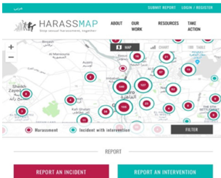
Figure 6. HarassMap (2019)