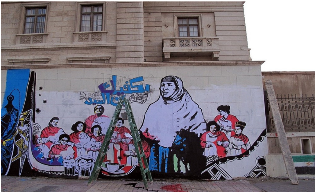
Figure 10. WOW (2018)

I saw a very famous mural from WOW in Alexandria that depicted Amina, the fictional character from the novels of the Cairo Trilogy by Naguib Mahfouz. In this graffiti, Amina was seen with her children, who are an example of the Egyptian people, and she said ' si al-sayyid ' ('enough is enough') to her bossy husband (Fig. 10).