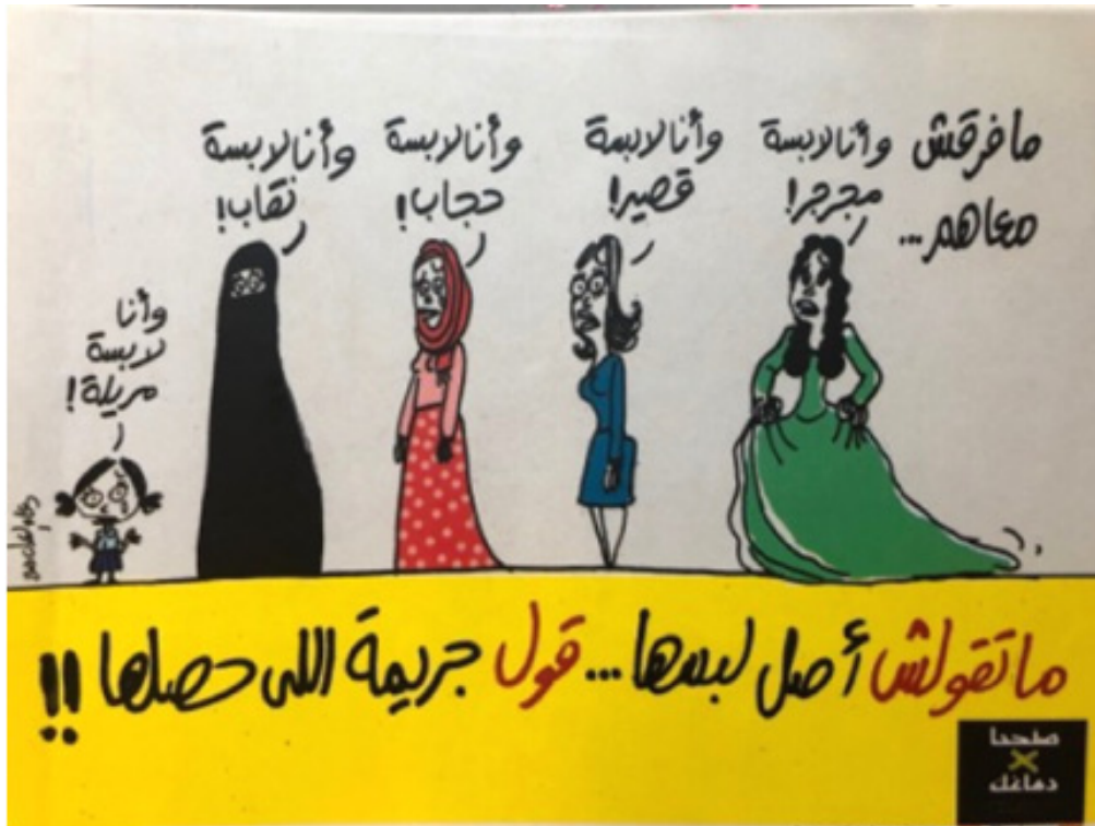
Figure 8. A cartoon by Doaa Eladl on a leaflet from HarassMap headquarters (2014)

The results of the anti-harassment movement's efforts had contributed to legislating the new law against SH – days before interim Prime Minister Adly Mansour handed over power to El-Sisi in 2014 (Kirolos, 2016). These results led to the recognition of SH at the legal level. Thus, the effect and results of the interviewees' visibility was apparent, through which the interviewees overcame, to a moderate degree, their marginalisation after the triumph of the recognition of SH. With a moderate degree, I mean even though they received recognition, in practice, SH still remained a problem to be tackled in the public sphere.