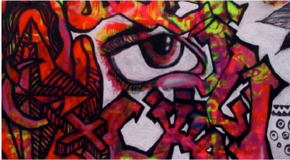
Figure 13. Author's own photograph (2014)