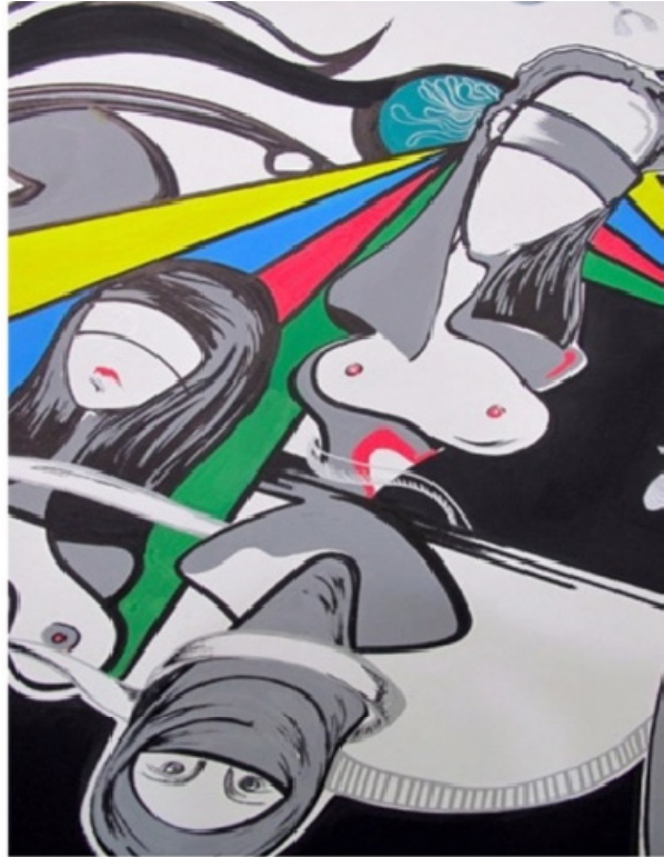
Figure 12. WOW (2015b)

In this way, a woman's body could be recognised in its sincerity and dignity. The graffiti gained greater public attention when it attempted to redefine the notion of sexuality in what was perceived as a woman's private body to make it public. The attempt challenged the Islamists and state secular discourse that sought to control women's bodies by reducing them to honour culture (Pratt, 2020).