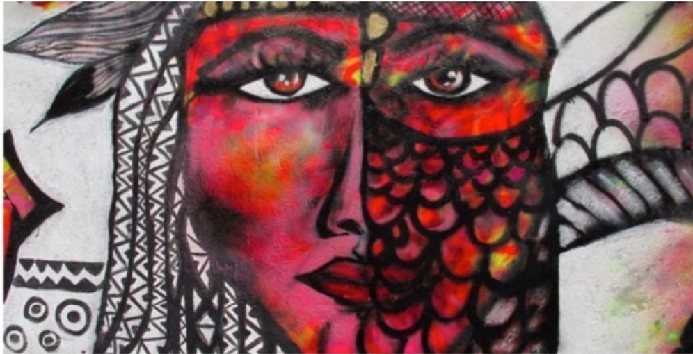
Figure 14. Author's own photograph (2014)

I draw a face in two parts. The first part expresses the half face of a pharaonic woman who enjoyed her political and social rights, like Cleopatra and Nefertiti, who possessed the greatest civilisation in all history. We shall move on, but the situation of women has worsened. The second part expresses the half face of today's Egyptian woman who is oppressed by society. Her face looks like to be broken and hidden behind the mashrabiyah (traditional windows in old-fashioned Egyptian buildings).