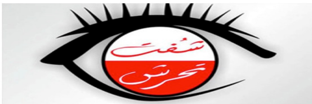
Figure 5. ISH logo from a leaflet brought from the ISH headquarters in 2014

In this regard, ISH used semantic symbols to encourage people to pay attention to harassers instead of women's bodies. For example, ISH's logo is a large eye (with the Arabic inscription ISH) (Fig. 5), which symbolises surveillance not by the regime or police or other official organisations but by ordinary people who observe the regular harassment of women. Volunteers in the teams wore this logo on their T-shirts, and it was also printed on the leaflet.