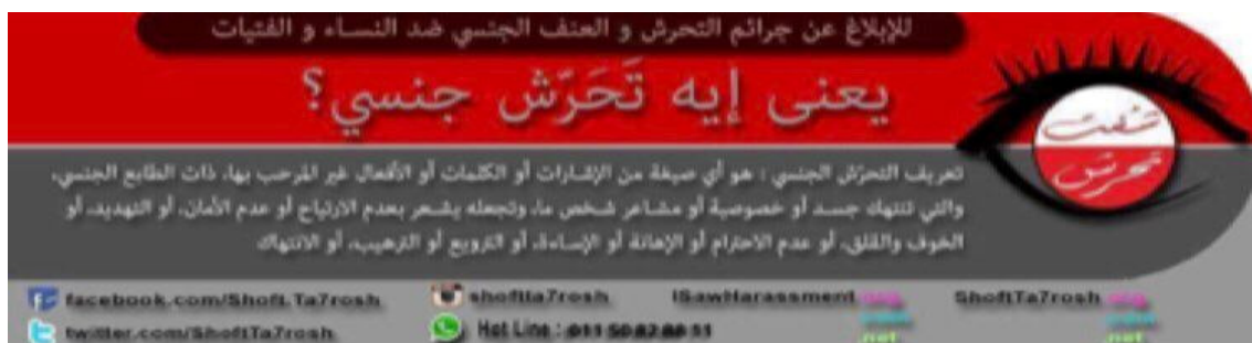
Figure 3. ISH (2018)

Figure 3 shows ISH’s widely distributed leaflet. It illustrates how ISH took its activism to the streets to raise public awareness about SH and how SH constitutes a significant threat to society, not just to women. In the image, ‘What is SH?’ is written in Arabic (own translation).