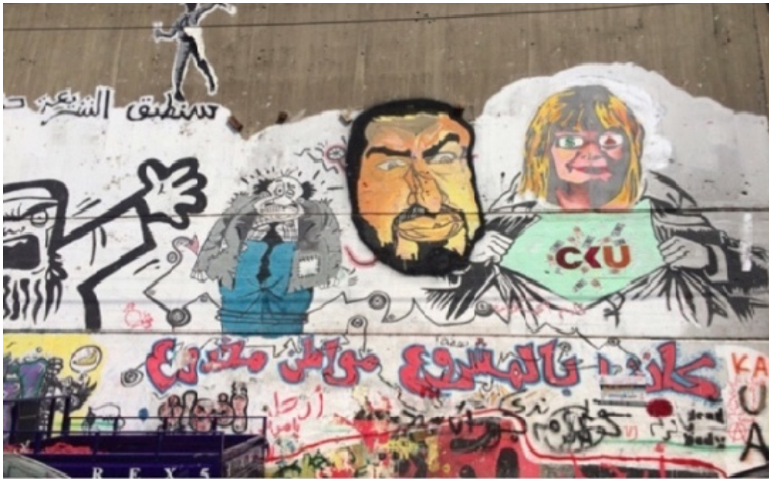
Figure 16. Author's own photograph (2014)

Thus, removing graffiti might be intended to separate some of the perceived political content in the public space from integration into the public sphere by marginalising certain issues such as feminine figures in a public space; it represented the dominant cultural discourse that the Islamists and the state had in their struggle against Western cultural hegemony.