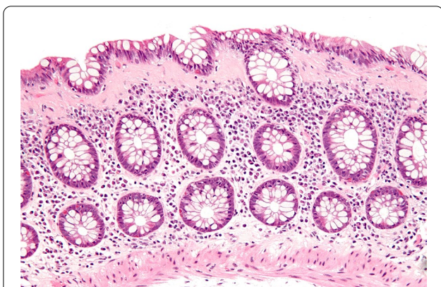
Fig. 1 Histological features of collagenous colitis. High magnification micrograph of collagenous colitis, H&E stain (Collagenous colitis—high mag—Collagenous colitis—Wikipedia) by Michael Bonert, MD, FRCPC. Copyright © 2011 Michael Bonert, MD, FRCPC ( https://commons.wikimedia.org/wiki/User:Nephron / https://fhs.mcmaster.ca/pathology/contact_us/faculty/faculty_bios/Bonert.html ). Licensed under CC BY-SA 3.0 ( https://creativecommons.org/licenses/by-sa/3.0/legalcode )

fibrogenesis and fibrinolysis which results in an impaired degradation of ECM proteins [3, 4].