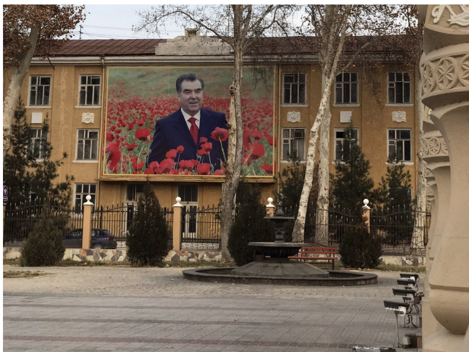
(President in the poppy field, Khujand, Tajikistan)

2015. Indeed, during our visit to beautiful cities of Dushanbe and Khujand, it was impossible to ignore the enormous portraits of the leader of the nation on almost every single state, educational, or social building, park and square. Our observations show that portraits on buildings have both cultural and social importance, and are known to be symbols of pride for the leader and the future of the country. In our perception, the most fitting portrait was on a Soviet-style building, showing the smiling state leader in the poppy field I saw during my visit to the national park named after Kamoli Khujand in Khujand city.