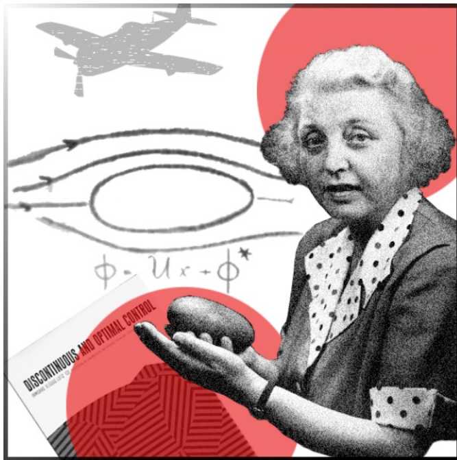
Figure 2. Irmgard Flügge-Lotz.

systems, the simplest form of feedback control. An on-off controller drives the manipulated variable from fully closed to fully open depending on the position of the controlled variable relative to the setpoint. A typical example of on-off control is temperature control in a domestic heating system. When the temperature is below the thermostat setpoint, the heating system is switched on, and when the temperature is above the setpoint, the heating switches off. There are many examples of discontinuous control systems in our house appliances, for example, fridges and freezers, ovens and water heaters. They also occur in some non-critical industrial appliances, where the error between the setpoint and plant output can vary with a relatively large amount, such as furnaces.