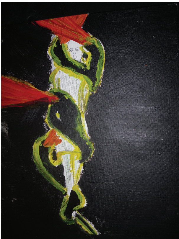
Figure 3. The caged self.

By using the Turkish metaphoric proverb “ AçIn halini tok bilmez, hastanIn halini sağ bilmez ” [A satiated man does not know what hunger is, a healthy man does not know what disease is], she tried to describe her feelings of loneliness and