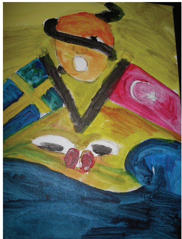
Figure 5. The fearful self.

When experiencing a fearful self, by way of precaution, she could describe a changing life with personal growth toward "some independence." On the other hand, she talked about her fear of being unable to live independently of the family. She used the proverb " Ana gibi yar, vatan gibi diyar olmaz " [There is no lover like mothers, nor a place like homeland] to emphasize her ties to her family and country of origin. This proverb also reflected how her emerging self was based on group ties, loyalty, interdependence, and obligations. With the crying heart, the fourth picture also expressed the fear and sadness she felt and the safety she lost when starting to move from an interdependent to an independent