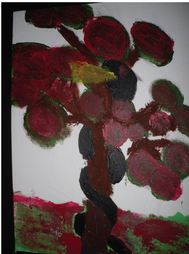
Figure 2. The ill self.

and a paper in her hands. On the other side of the room a man was standing and a woman who sat with her head bent. Between them was a woman with her eyes closed and her mouth open in a scream. This picture became a tool for story-telling about her course of treatment, which had lasted more than 11 years. She described a variety of people in the psychiatric care services and other authorities who formed part of her life in an irregular manner. She had been frustrated, exhausted, and distressed when her mother had been crying and her father had been angry in the meetings with the psychiatric team. She could not be open and talk freely about what was bothering her because of the Turkish cultural norm that obliged her to show respect toward her parents by being quiet and polite. The treatment staff, however, misinterpreted her non-disclosure behavior as an act of being frightened of her parents. They could not understand each other and she did not understand any of them. She thus became increasingly withdrawn and felt that she was invisible and that nobody cared and noticed her. She was increasingly frustrated and could not stop the thoughts that just ran around in her head and then transformed to evil, snakes, and pain.