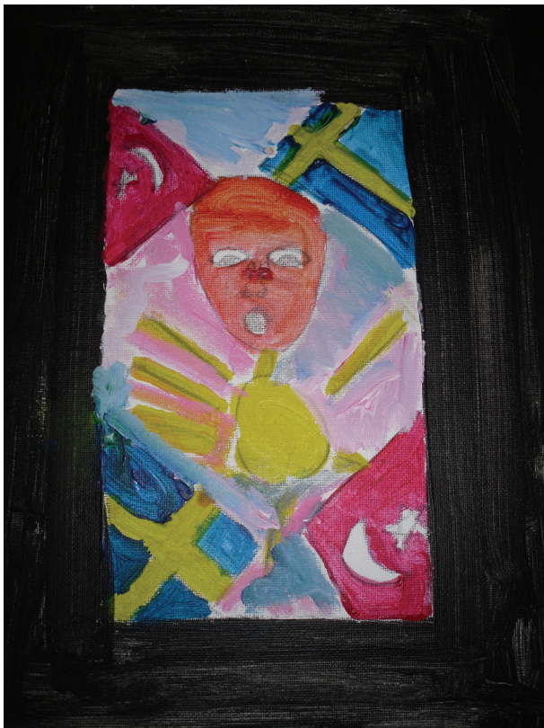
Figure 6. The released self.