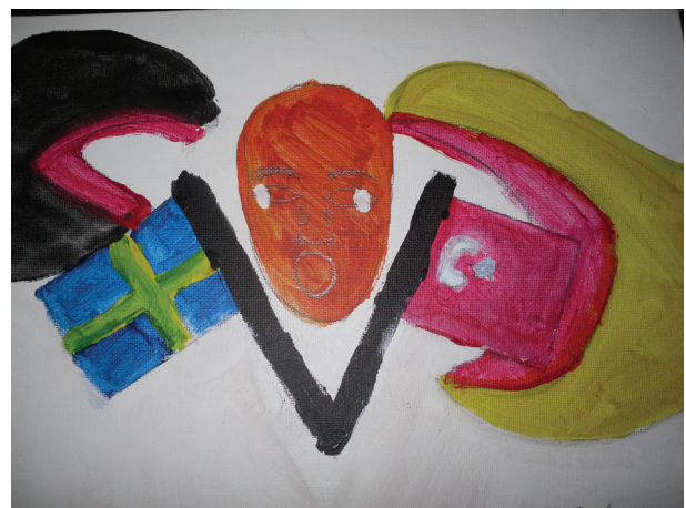
Figure 4. The confused self.

The third painting (Figure 4) illustrated how two big snakes, each with one flag in their mouths, a Swedish and a Turkish, represented the two cultures. In this picture she was no longer a jailbird, but she was free