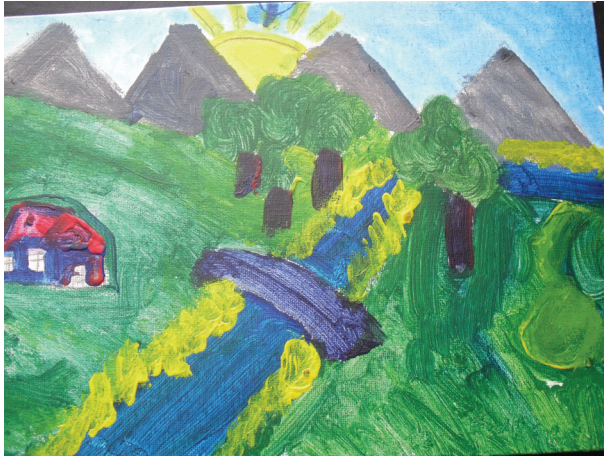
Figure 7. The integrated self.

changed, and how things were for her at that point in time.