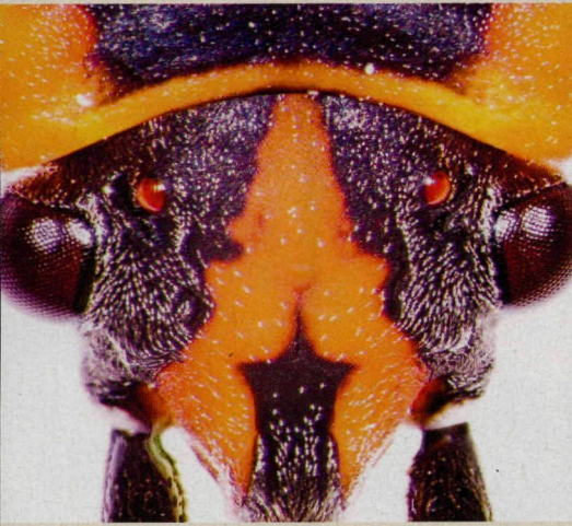
Biologist Cynthia Tedore uses a photo processing technique called focus stacking to obtain precise images of small organisms. Visible here, starting from the upper left and moving clockwise, are the tiger beetle Cicindela sexguttata , the fire ant Solenopsis invicta , the jumping spider Lyssomanes viridis , the katydid Orchelimum pulchellum , the common buckeye Junonia coenia (twice), the leaf-footed bug Leptoglossus phyllopus , hatching eggs of the jumping spider L. viridis (twice) and the large milkweed bug Oncopeltus fasciatus .