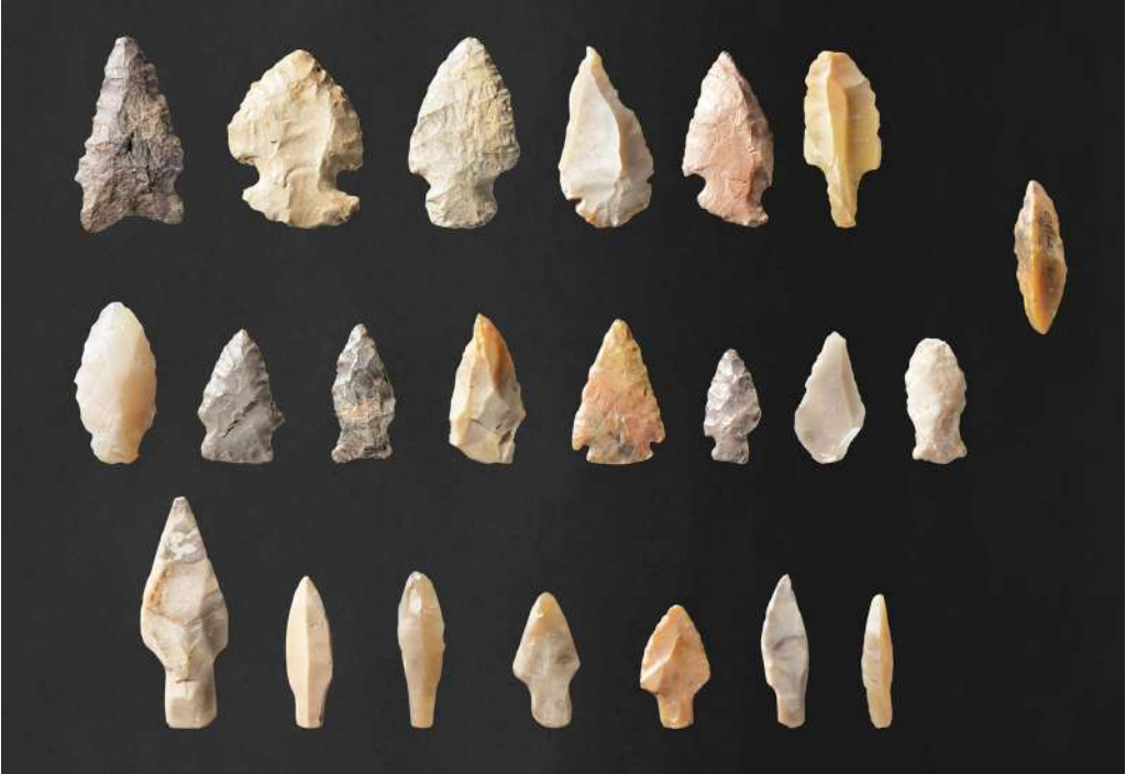
Fig. 8. Native American objects from Texas likely dating to the Archaic (c. 8000-1000 BC) (No E1.1-24). Part of the founding collection of Museum Skanderborg, held in a box labelled “ethnography” within a larger box labelled “curiosities”. This box also included pottery from Jericho (No U1. 1-24) as well as iron-tipped arrows and an axe allegedly from the Republic of the Congo (No E1.25-69).

likely that many objects have been destroyed without any record of the objects ever existing. This may be particularly relevant for many Native American objects as they do not easily fit into the standard recording procedure at many regional museums and they were often collected at a time when records may have been more inconsistent.