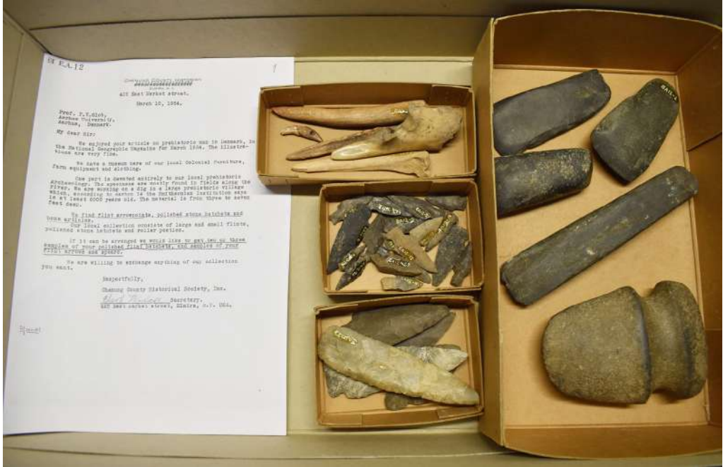
Fig. 7. Assorted box of the artefacts from the Lamoka site (c. 6000 BP) exchanged between Chemung County Historical Society in New York and Moesgaard Museum in 1954 (No EA12).

there by the Homestead Act of 1862. These tense and complex realities coloured attitudes towards each other. The collected object and archival material can be productively used to highlight intricacies of these histories and their modern legacies. Such a perspective was utilized by, for example, Sarah Hill (1996) in her examination of early nineteenth century Cherokee baskets from the collection of the Moravian Historical Society (donated later to the Peabody Museum at Yale University). Her object and archival studies identified the likely makers and collectors of the baskets and produced a rich story of the lives and agency of Cherokee women as well as intercultural relationships between the indigenous woman who produced the baskets and the German missionary woman who collected them –