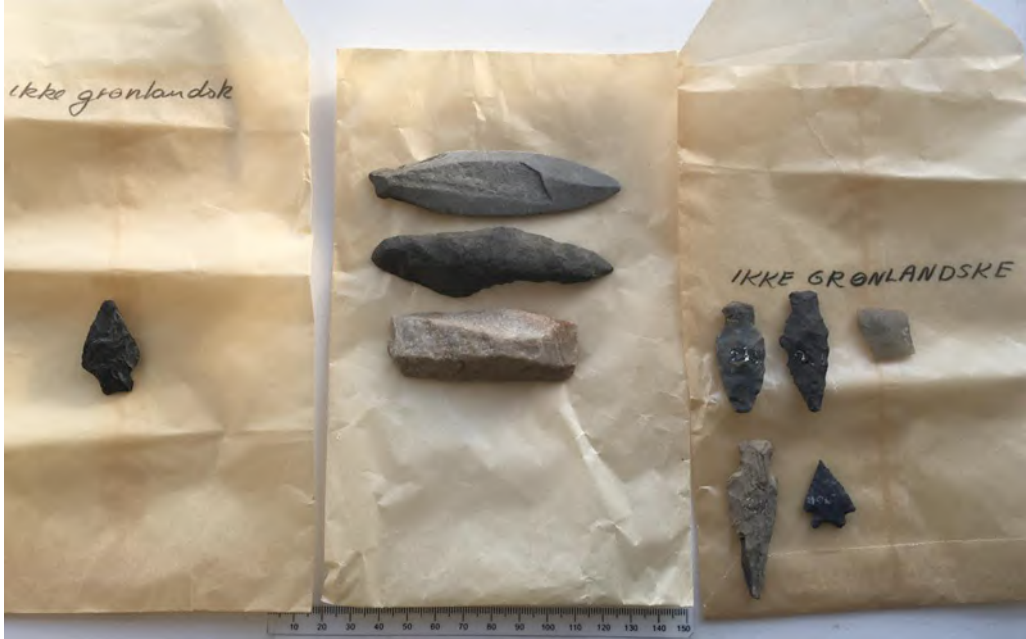
Fig. 9. These arrowheads (the collection of MKH – not inventoried ethnographical collection) are held in the Greenlandic collections Museum of Koldinghus’ collections, however someone clearly believed that they were not Greenlandic and as they wrote “Non-Greenlandic” on the bag they are kept in. Does whether they are Greenlandic or Native American or something else make a difference for the value of these objects and their justification within the museum’s collection?

Jen Shannon, University of Colorado Boulder, pers. comm. 2017).