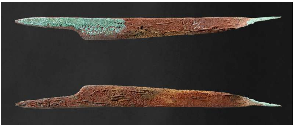
Fig. 6. Obverse and reverse of the so-called “copper knife” in Museum Skanderborg’s collections (No. 32/77a).

The examples above highlight multiple and complex meanings of Native American objects for Danish collectors and their potential to enlighten historical and cultural aspects of Danish engagements with America and Native Americans. These objects, treated collectively or as individual assemblages and analysed alongside diaries, letters and other narratives can contribute to a better understanding of the perceptions of and interactions between Native Americans and Danes travelling to and settling in America. A major moment in Danish direct engagement with the continent happened in the 1860s–90s and took a form of large-scale migration. This migration coincided with Native American removal, colonial appropriation of indigenous lands, reservationisation and the final stages of the Indian Wars fought west of Mississippi River – a destination of many migrant families enticed