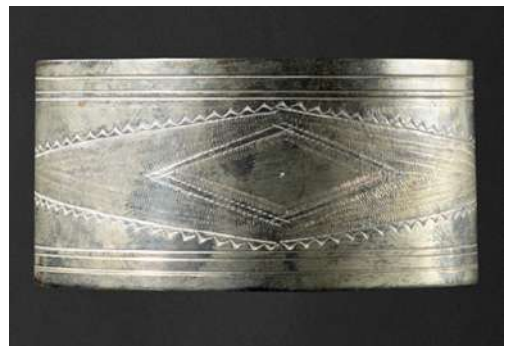
Fig. 3. Silver bracelet held at Vendsyssel Historiske Museum (197370145+). It was apparently hand-made by a Native American who gave it as a gift to a woman whose relative handed it in to the museum in 1973, circa 120 years later.