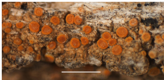
Fig. 2. Caloplaca montenegrensis , general habit (CANB – holotype). Scale 1 mm.

Apothecia very small, usually numerous, scattered, concave at first then plane, 0.2–0.4(–0.5) mm diam. and 0.18–0.28 mm thick, becoming biatorine or zeorine, with dull yellow to dull brownish orange discs, matt, sometimes with very scarce whitish pruina, true exciple distinct, pronounced, bright to dull yellow, 0.05–0.07 mm thick, thalline exciple becoming excluded, seen merely at the base of the apothecia, somewhat brownish to greenish grey or dull brownish white; in section zeorine, thalline exciple 50–80 \mu\text{m} wide, cortical layer not developed or to 20 \mu\text{m} thick with an epinecral layer 7–10 \mu\text{m} thick, usually with dust crystals; algal layer below true exciple to 40 \mu\text{m} thick, broad, often reaching mid-hymenium level in the lateral portion; true exciple 20–40(–50) \mu\text{m} thick in the uppermost lateral portion, with thick walled rounded cells 5–6 \mu\text{m} diam., and 10–20(–30) \mu\text{m} thick in the lower lateral and in basal portion, sometimes not seen in basal portion, paraplectenchymatous; hymenium 55–60(–70) \mu\text{m} high, hyaline; epihymenium 5–7(–12) \mu\text{m} thick, somewhat greenish orange to brownish orange due to numerous