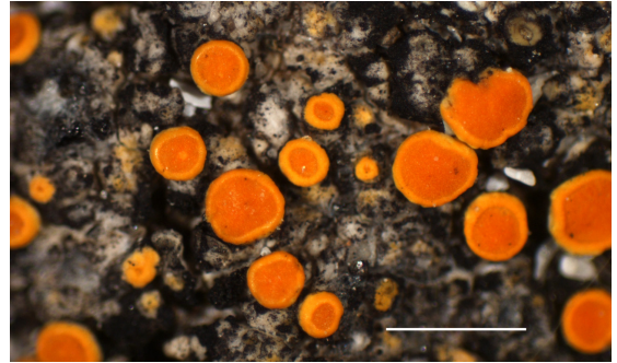
Fig. 1. Caloplaca mallacootensis , general habit (I. Kärnefelt 978204 – LD). Scale 1 mm.

coastal rocks, locally abundant, 05.02.1999, Kärnefelt 998301 (LD); Otago, Old Man Range, N of Roxbough, on the road to Obelisk, 45°20.15'S, 169°16.16'E, c. 700 m alt., on shaded schist rocks, 07.02.1999, Kärnefelt 999002 (LD); North Island: N of Wellington, Pukerua Bay, 41°01.55'S, 144°54.11'E, on coastal rocks, growing together with C. jackelxii , 13.02.1999, Kärnefelt 9910601 (LD).