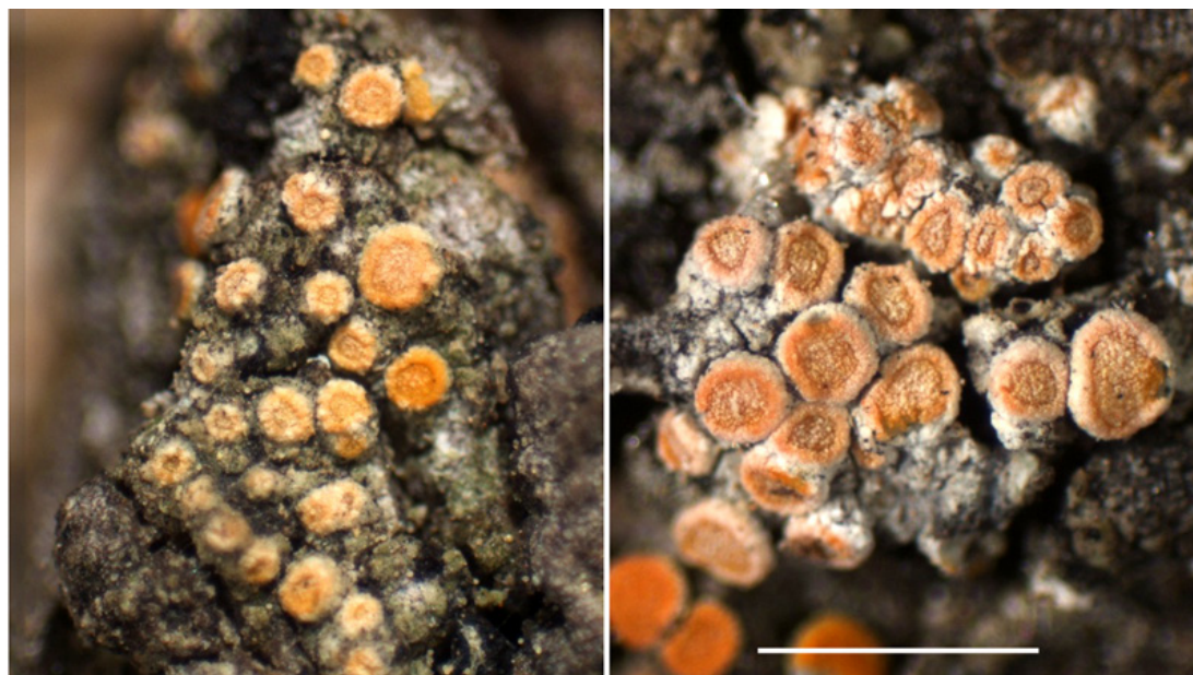
Fig. 5. Caloplaca subgyalectoides , general habit (CANB – isotype). Scale 1 mm.

this new species to the African taxon, Caloplaca gyalectoides S.Y. Kondr. & Kärnefelt.