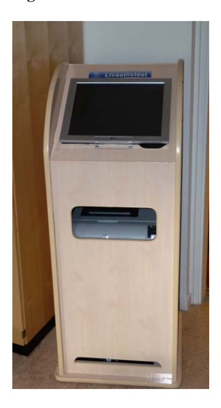
Figure 1. The e-SBI touch-screen IT-kiosk.