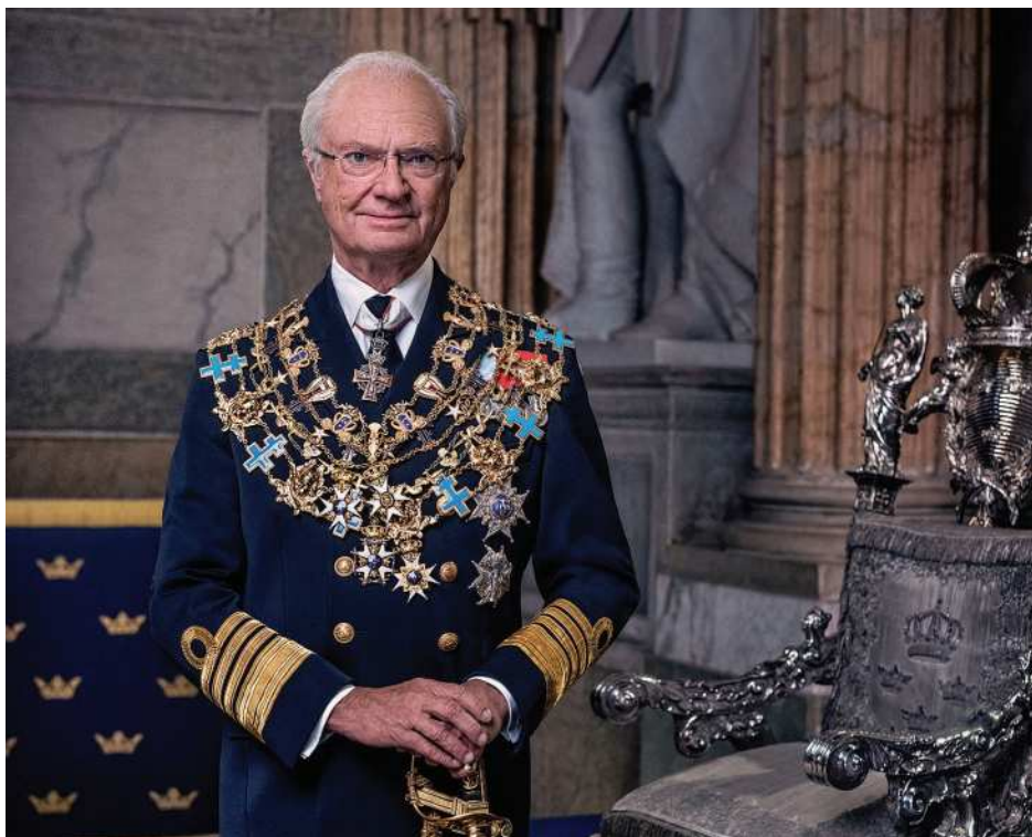
Figure 9: portrait of H.M. King Carl XVI Gustaf of Sweden, in 2023 celebrating his Golden Jubilee. He is wearing the collars of the Orders of the Seraphim, the Sword, the Polar Star and Vasa.

shall continue to be reserved for members of the royal house and foreign heads of state, and holders of similar offices. 82 On 15 June 2022 parliament approved the guidelines proposed by the government, as regards the reformed public reward system and how it should function. 83 A new ordinance was issued by Government on December 15, 2022. 84