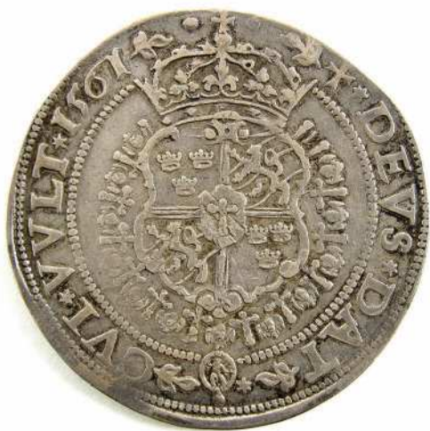
Left, Figure 1 : Count Carl Gustaf Tessin wearing a robe of a councillor of the realm, the collar and insignia of the Order of the Seraphim, and the insignia of the Orders of the Sword and the Polar Star. Painting by Gustaf Lundberg (1695–1786), photo: Hans Thorwid, Nationalmuseum, Stockholm; right, Figure 2 : coin from the reign of Eric XIV with the collar of the Order of the Saviour surrounding the royal coat of arms, Nordiska Museet, Stockholm, photograph by Thomas Adolfsson.

receive Swedish orders and so not be tempted to receive foreign orders which might encourage dependency on a foreign power. The Russian ambassador was known for having tried to bribe members of parliament in this way. 7