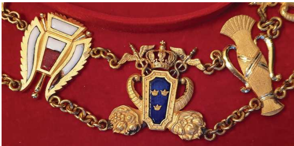
Figure 7: the collar of the Order of Vasa

to the recipient's birth or rank; princes of the Royal Family were not to be born knights of the order. 46 This was a time when industrialists, factory and foundry owners, peasants and workers were observed – they could have an impact on the Swedish economy, and were to be rewarded through orders and medals. 47