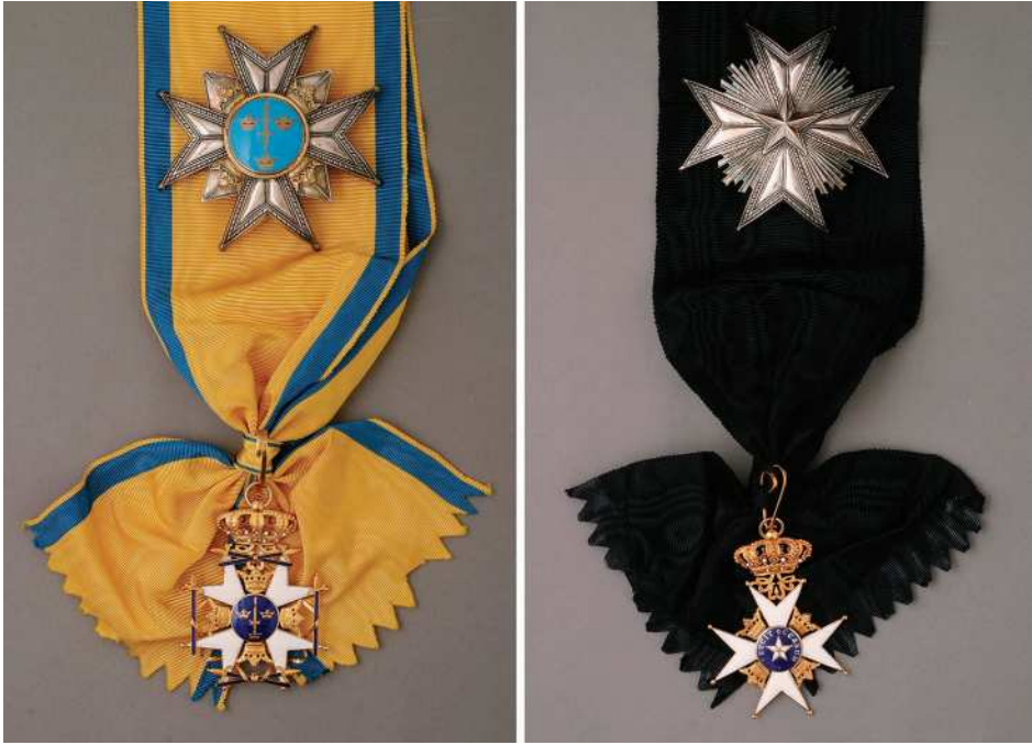
Left, Figure 5 : the star and sash of a Commander Grand Cross of the Order of the Sword; right, Figure 6 : the star and sash of a Commander Grand Cross of the Order of the Polar Star.

in 1938, it was not a coincidence that the polar star was chosen as a symbol for the third order: In the seventeenth century the polar star had become a symbol of Sweden and its position in the north, and it was used by Charles XI and Charles XII in cyphers. The motto nescit occasum referred not only to the polar star but also to Sweden and its honour. In the eighteenth century, the symbol was connected to learning and genius, something that seems to have started when the Royal Academy of Sciences adopted the polar star as its symbol in 1741. 44