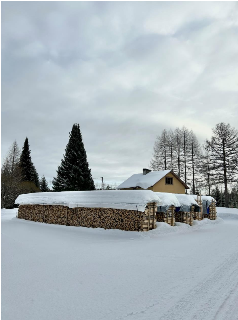
Wood stores for winter, Finland.

Our initial analysis highlights a set of key themes discussed by participants in the oral histories: