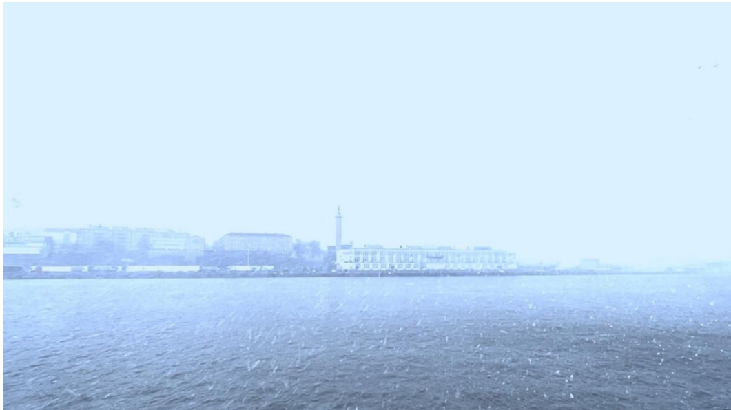
Source: Film still exploring from video diary exploring embodied and disembodied relationships to home heating.