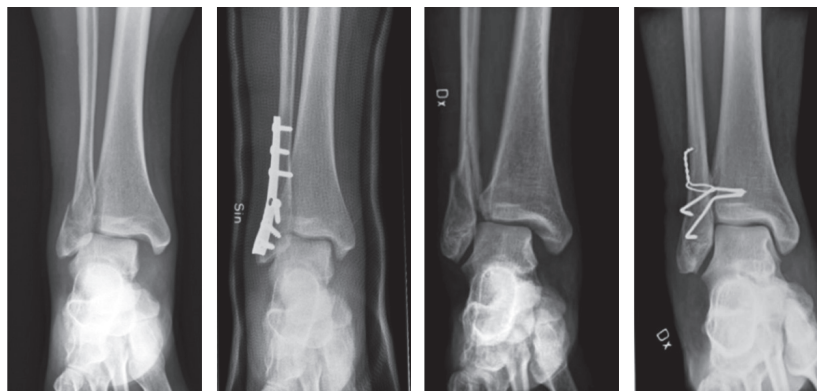
Figure 2. Typical fractures and treatment with the AO method (left panels) and the Cedell method (right panels).

Classification of ankle fractures was done using the AO/Weber classification