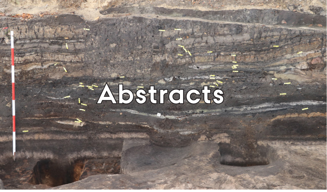
Section through stratigraphy at SJM 3 Posthustorvet, looking SE. The microlaminated stratigraphy offers a rare high-definition archive of developments in the emporium.