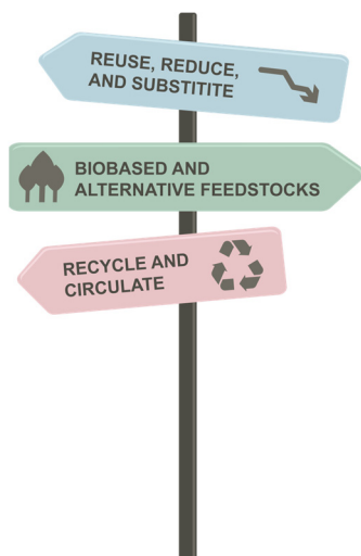
Figure 1: Three potential decarbonisation pathways for plastics.

Plastics can decarbonise in a variety of ways. In Bauer et al. (2022) we divide the plastics feedstock decarbonisation into three main pathways that address different parts of the value chain. These three pathways include reduced use, bio-based and alternative feedstocks (e.g. carbon dioxide) and recycling, see Figure 1. First, reduced production of plastics should be considered. This is crucial since all other decarbonisation pathways include limitations that mean that decarbonised plastics cannot be produced in the same volumes as today. Hence, without decreased demand and production, decarbonising plastics would fail to materialise (Meng et al., 2023). Further measures include increased reuse and substitution efforts, such as second-hand markets, refillable packaging and substitution with other materials (Bauer et al., 2022). These are all strategies that would reduce the demand to produce virgin plastics in line with the increasing number of calls for a global limit on plastics production (Bergmann et al., 2022). However, the projected production growth in the plastics industry does not speak in favour of this happening voluntarily any time soon (Bauer and Fontenit, 2021).