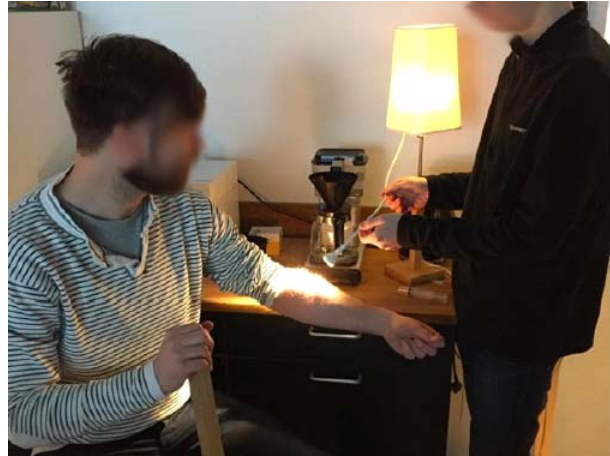
Figure 2. The lighting concept consisting of a flexible spotlight that can be integrated into existing lighting solutions. Concept and images by Martin Cavdarovski, Per Croona, Albin Loeb, and Linus Malmberg.