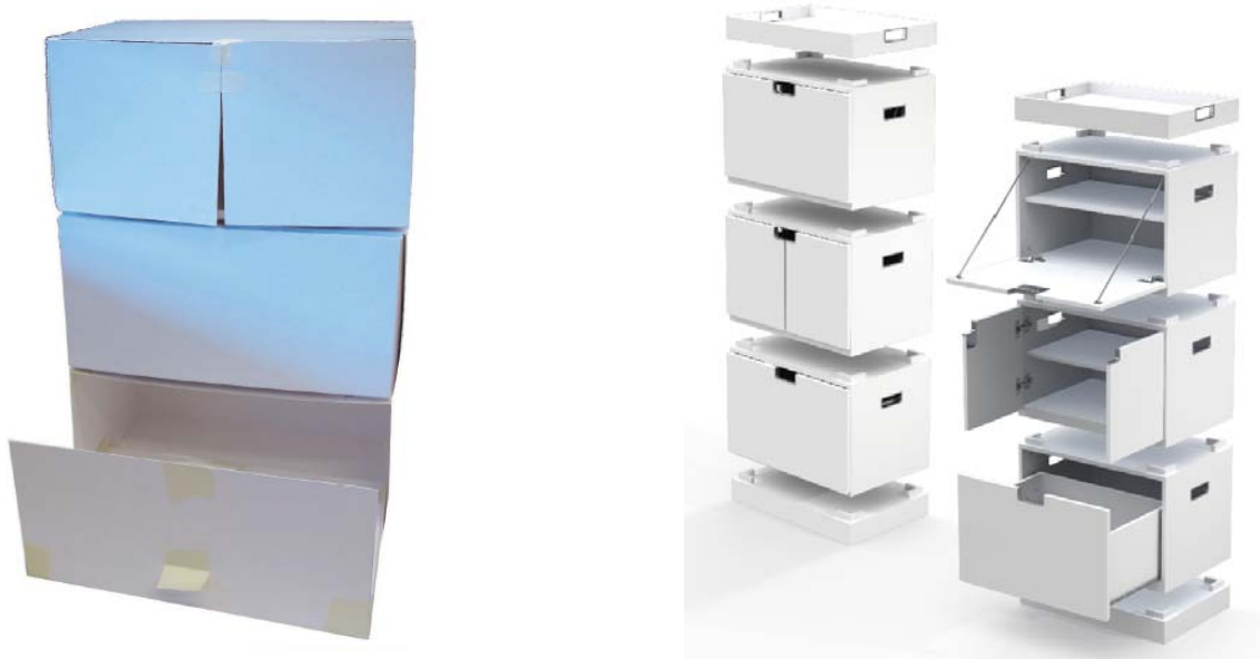
Figure 1. Early (left) and late (right) versions of the storage furniture concept. Concept and images by Lise Lokøy and Viktoria Zagar.

configuration. The three modules are individually designed to fit specific needs: one standard cupboard for storage of standard material such as disposable gloves; one module for medicine handling including a foldable, designated working area for the task; and one drawer for storage of larger volumes such as a two-week consumption of diapers. This design creates a piece of storage furniture that is flexible enough to fit the diverse needs of different care recipients. The top tray is also removable so that material can be put there and carried to the location of the care recipient for further interaction. The idea is to also offer the furniture in various materials so that the care recipient can choose an exterior that fits in with their home environment.