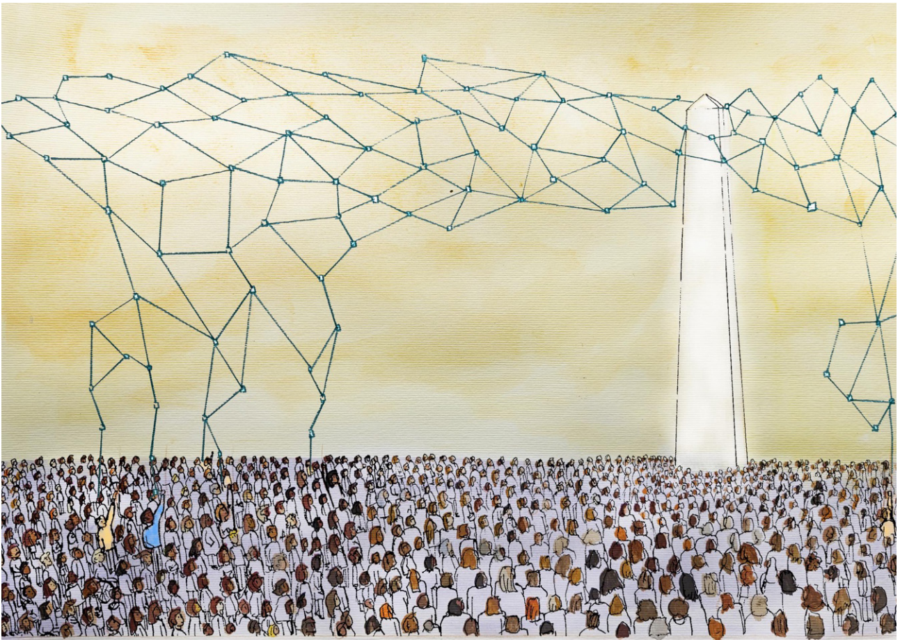
A neural network emerges from the top of an ivory tower, above a crowd of people's heads. Some are reaching up to try and take control and pull the net down to them. Watercolour illustration. Jamillah Knowles & We and AI / Better Images of AI / People and Ivory Tower AI 2 / CC-BY 4.0

However, despite existing human rights and AI scholarship that focus on these impacts, AI can impact a wide variety of human rights as human rights are also interrelated, interdependent and interconnected . Biased or inaccurate AI decision-making within public services can mean that the right to education, healthcare and work can be negatively impacted. In turn, when it is difficult for individuals to gain insight into how an AI system made a decision or functions, accountability for wrongs or harms that occur cannot be achieved. This can jeopardise the right to a meaningful remedy under human rights law.