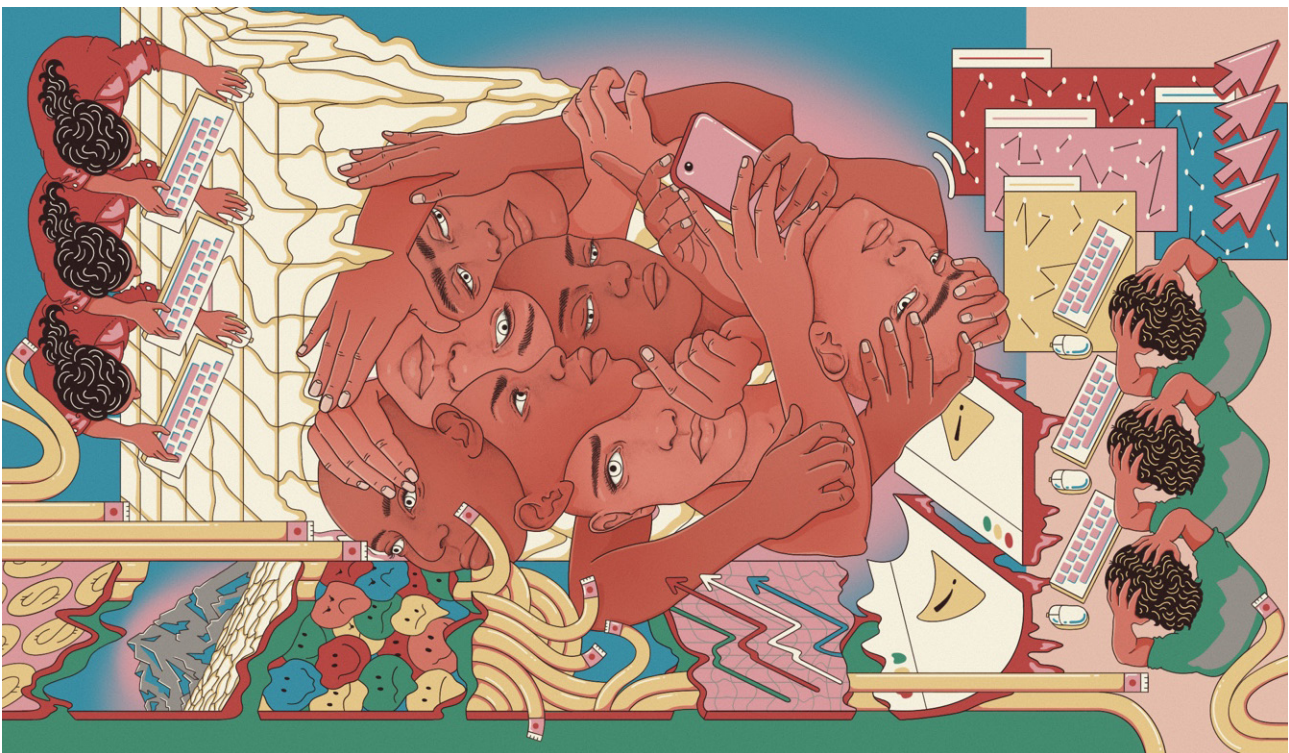
An illustration that can be viewed in any direction. It has several scenes within it: people in front of computers seeming stressed, a number of faces overlaid over each other, squashed emojis and other motifs.

First, the rise of disinformation and misinformation enabled by AI, including through the use of deep-faked imagery but also generative AI tools such as image, audio and text generation, can actively enable hostile counter-narratives and distort the fragile and contested post-conflict information environment. This can directly impact truth-telling efforts by grassroots and community groups and “undermine the work of human rights documenters and advocacy efforts for the justice of victims.” 48 Addressing such a challenge might require taking a multi-pronged response , involving not only regulation but also promoting AI literacy amongst civil society, victims’ groups and affected communities, addressing the role and responsibilities of platforms that host and curate such content and working with existing organisations or efforts to address content provenance and authenticity, such as through the Coalition for Content Provenance and Authenticity (C2PA). 49