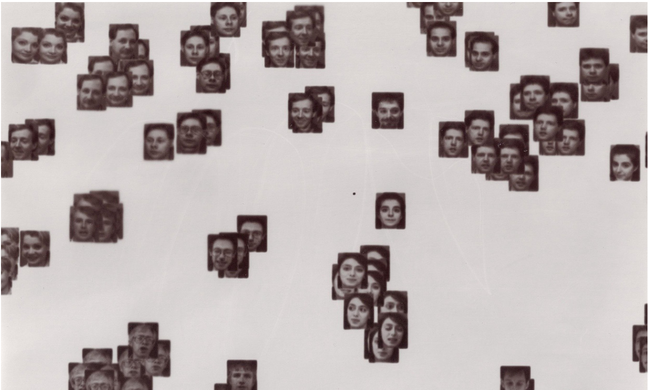
A laptopogram populated by scattered, monochromatic portraits and grouped according to similarity. The groupings vary in size, ranging from single to overlapping collections of several faces. The facial expressions are neutral, representing a mix of ages and genders. Philipp Schmitt & AT&T Laboratories Cambridge / Better Images of AI / Data flock (faces) / CC-BY 4.0

AI can also assist in the search for missing persons through the use of facial and object recognition, contributing towards strengthening accountability, truth-seeking and reconciliation. As AI enables the analysis of various types of data at scale, it can thus also assist in the reparations process – enabling harms to be properly assessed and compensation to be allocated and accounted for. By the same token, the ability of AI to sift through large datasets and discern key patterns and emerging trends can also mean that it can identify risk factors and act as an early warning mechanism, contributing towards non-recurrence as well as the goal of sustainable peace pursued by transitional justice.