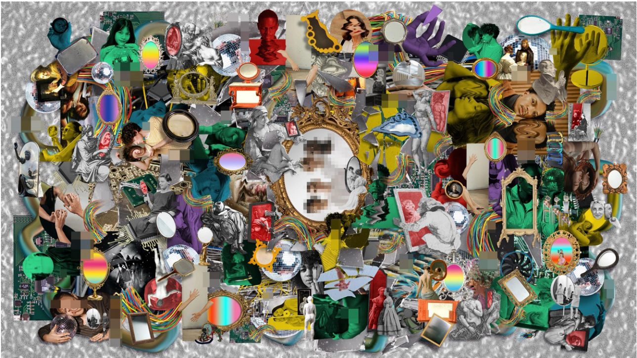
Collage with mirrors reflecting diverse human figures, symbolising AI data's human origin and the human-in-the-loop concept.

a “leapfrog” technology. 11 The many national AI policies in place consider that AI offers a distinct advantage of speed, scale and efficiency. Some policymakers go as far as saying that AI is not just a tool, but in effect unlocks a whole new world. 12