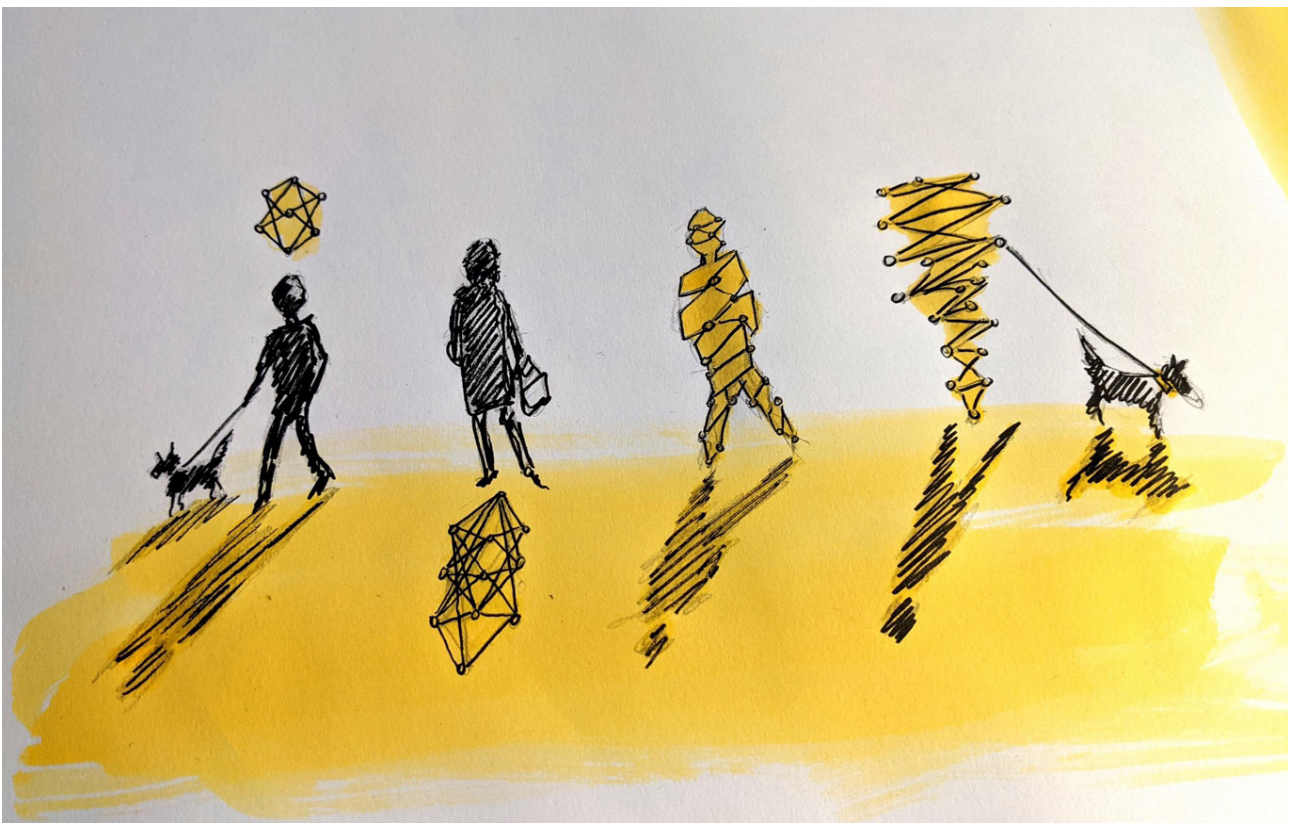
An illustration showing the silhouettes of four people, two of whom have dogs on leads. They all cast shadows, and vary between realistic representations and those formed by representations of algorithms, data points or networks. The people and their data become indistinguishable from each other. Jamillah Knowles / Better Images of AI / Data People / CC-BY 4.0

However, even without AGI, existing generative AI such as large language models can already pose a risk to humanity, including through potential misuse by nefarious actors to carry out cyberattacks, or biochemical or genetically-engineered warfare – all of which can bring serious risks to human safety and security. Experimenting such uncertain (and risky) technological paths raises questions of human dignity as it treats adopters of such technology as a means to an end, especially where societies and individuals would bear the risk of harm.