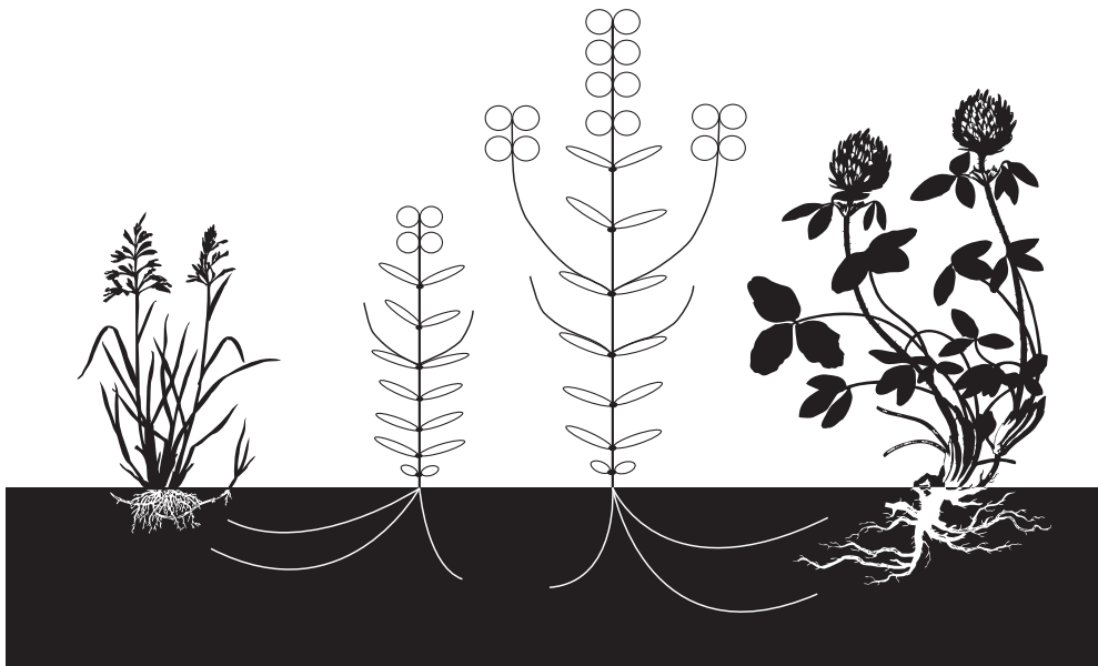
Figure 1. Two different host species affecting the phenotype of an annual rhinanthoid.

Rhinanthus angustifolius grows in open grassland habitats in Western Eurasia (de Soó & Webb, 1972). The species is widespread in Europe and has its northern