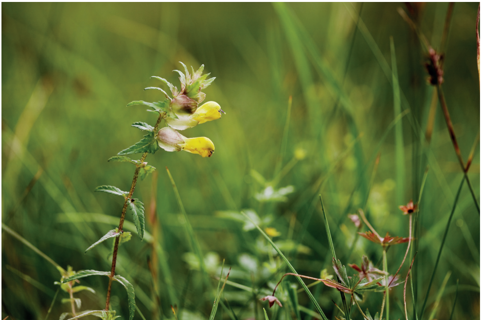
Figure 6. Plant of the fen ecotype on Gotland.

Finally, I would like to point out that even though we found no strong support for the current taxonomic recognition of the ‘meadow ecotype’ (ssp. grandiflorus ), it is still advisable to assign high conservation value to populations of R. angustifolius in traditionally-managed hay meadows, not only because of their cultural-historical value, but also because they have a potentially large effect on the maintenance of high species diversity in this habitat (Bardgett et al. , 2006; Cameron et al. , 2009)