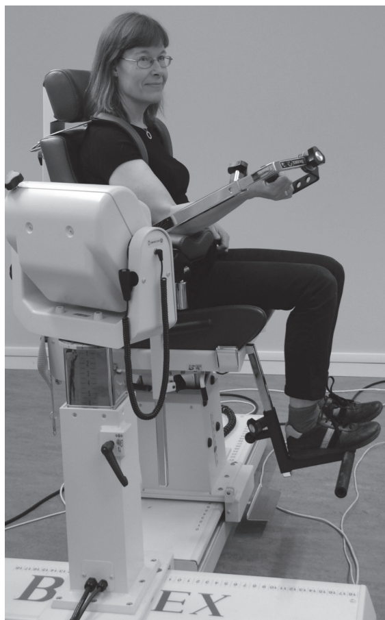
Fig. 1. Set-up and testing position for isokinetic elbow extension and flexion strength using the Biodesx System 3 PRO. A written permission is given from the patient to publish this figure.

The protocol to measure arm strength was developed from the Biodesx manual (22) with regard to the chair and dynamometer positions. The angle positions were chosen to allow safe and pain-free movements of the joints and to enable measurements of specific muscle groups. The muscle groups were selected based on the study by Harbo et al. (23). Before each test session, the system was calibrated to be within allowable limits recommended by the manufacturer. The isometric strength measurements were performed twice and the isokinetic strength measurements included 3 trials (Table I). The number of trials was based on previous protocols used in our research group (24, 25). The highest maximal voluntary isometric and isokinetic contractions from the Biodesx measurements were recorded as the highest peak torques in Newton metres (Nm).