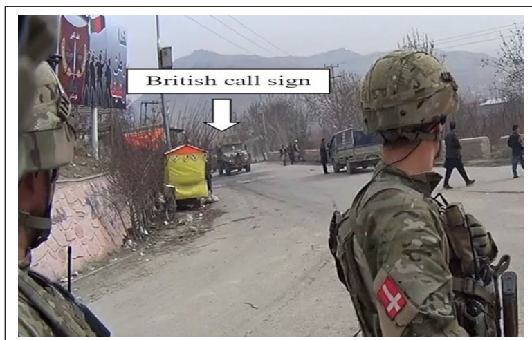
Figure 2. The soldiers notice the arriving vehicles.