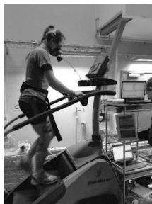
Fig. 1 A fully instrumented subject who performed the tests on the StairMaster.

The study involved the following moments: arrival of the subject, instrumenting the subject and climbing on the stair machine. The tasks on stair machine were to climb the stairs at selected pace in three levels (L1, L2 and L3) (Fig. 1). Any changes of the velocity were not possible during the exercise on each level. Nevertheless, since all subjects of this study did not climb the stairs with the same step rate (SR), then their relative effort was set individually at approximately the same and known level.