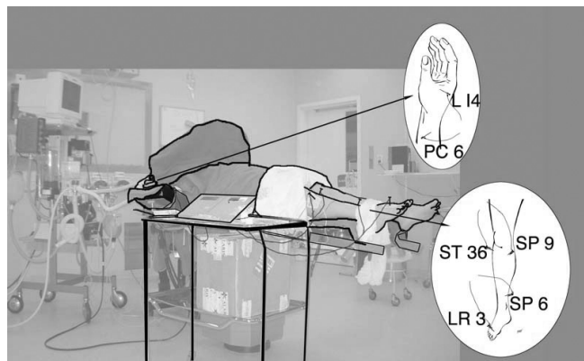
Fig. 2. Set-up with an acupuncture patient in the operating room. Acupuncture points are shown in circles. Electrodes were positioned accordingly in the sham patients.

After induction of anaesthesia by facemask with 6–8% of sevoflurane in 6 l min -1 of oxygen, EA