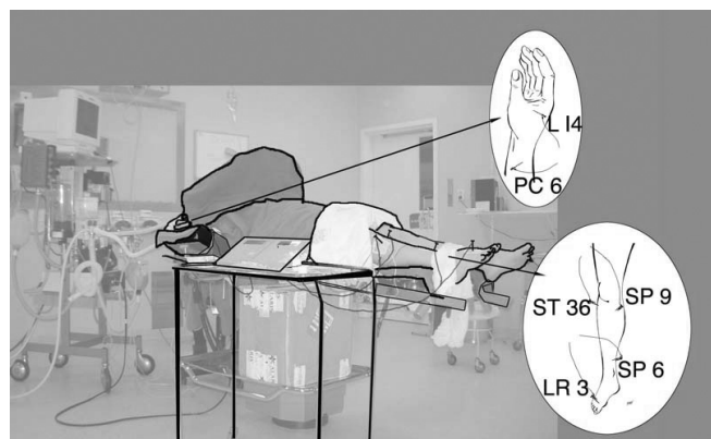
Fig. 2. Set-up with an acupuncture patient in the operating room. Acupuncture points are shown in circles. Electrodes were positioned accordingly in the sham patients.

After induction of anaesthesia by facemask with 6–8% of sevoflurane in 6 l min -1 of oxygen, EA