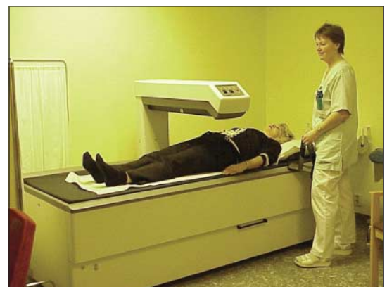
Fig 2 Measurement of bone mineral density at the hip and lumbar spine by dual energy absorptiometry

A selective case finding approach is recommended to recognise and treat those elderly people most at risk, ideally before the first fracture. 1 45 High risk individuals may be identified from risk factors for bone fragility or susceptibility to trauma. The key questions relate to previous fragility fracture, previous falls or unsteadiness, and risk factors for osteoporosis or low bone mass (fig 1). Positive responses should lead to a full assessment to confirm risk, provided the patient agrees to and is able to follow instructions for pharmacological treatment. Those at risk of osteoporosis should be assessed by bone mineral density measurement with dual energy X ray absorptiometry at the hip and spine if it will influence management (fig 2). Measurement of the calcaneus by ultrasonography may be used as an