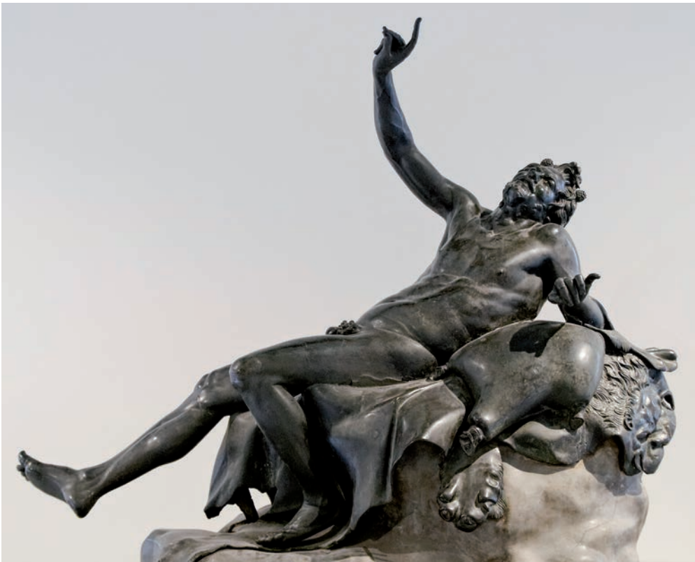
Fig. 7.5. Drunken satyr from Villa of the Papyri, Herculaneum. Museo Archeologico Nazionale di Napoli.