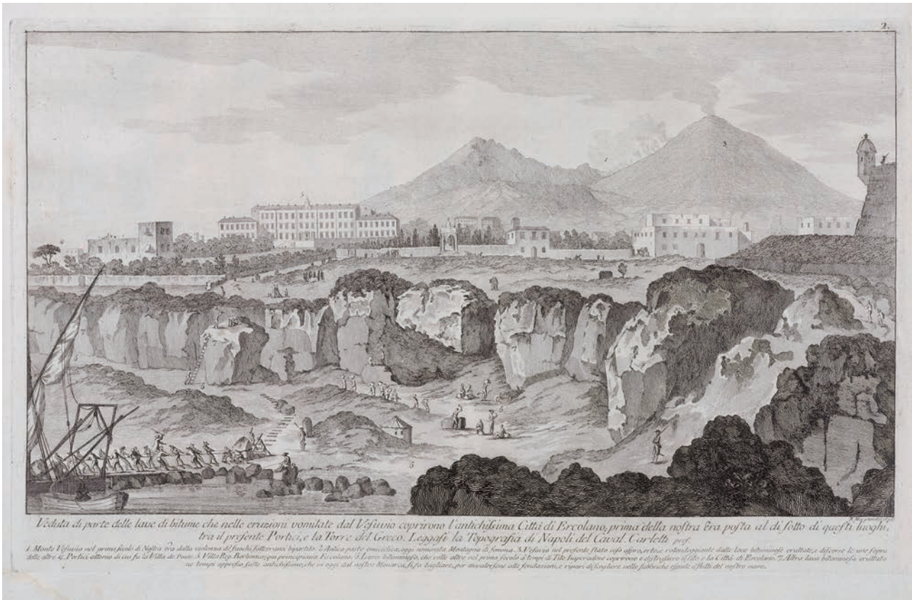
Fig. 7.1. The Palace of Portici and surroundings as seen by Filippo Morghen, engraver in Naples in 1765–1779. The Caramanico wing, which housed the Herculaneum Museum, is to the left side of the palace.

Louisa Ulrika's curiosity concerning the Vesuvian antiquities was most probably awakened in Prussia, 2 before her arrival in Sweden as bride to the heir of the Swedish throne in 1744. In the draft of a letter dated in 1749, belonging to the correspondence of the head of the state chancellery, Count Carl Gustaf Tessin, we learn about efforts made to satisfy her wishes to learn more about the excavations. Contacts had been established in Naples (unfortunately, the addressee of the letter can no longer be deciphered) in the hope of obtaining a description of the ancient city for the princess and also of furnishing her with medallions for her collections. Somewhat later, in a letter to her mother, Sofia Dorothea, Queen Mother in Prussia, Louisa Ulrika complains about the absence of information