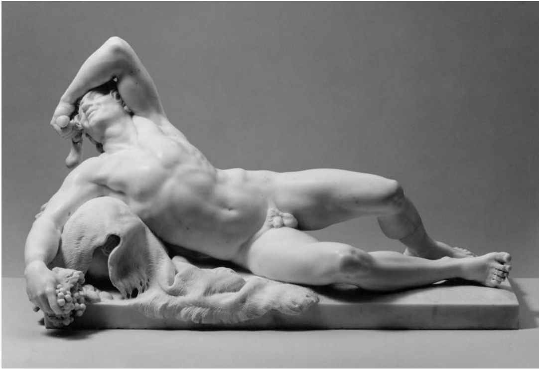
Fig. 7.3. Faun . Johan Tobias Sergel, 1777.

Papyri. 49 The “two metal figures that are well-wrought” are the two “runners”, also from the Villa of the Papyri. According to the Piranesi plan of the museum, they stood on each side of the doorway leading from the eighth towards the ninth room (Fig. 7.2, nos 120 and 120bis). 50 Both these rooms were centred on monumental vases, which Sergel probably confused in his memory; more correctly, it would seem, the one in the eighth room was in bronze, the one in the ninth of marble. Finally, in the tenth (?) room, the seated Mercury: “the best figure they have recovered”. Further, Sergel mentions sculptures in the staircase, both in bronze (praised by Winckelmann) and marble, though apparently he was not very impressed. The last piece he finds to his taste is the famous horse head in bronze. It was kept in the courtyard of the Palazzo Capranico.