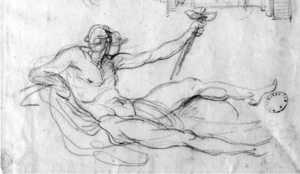
Fig. 7.4. Sketch by Johan Tobias Sergel representing a drunken faun probably made during Sergel's stay in Naples. Note the close similarity of the anatomy and twist of the torso as compared to the satyr from Villa of the Papyri. Red chalk. Nationalmuseum, Stockholm.