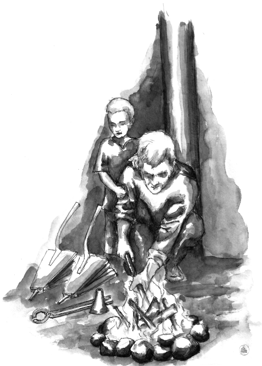
Fig. 4. Multimetalists at work. Drawing by Krister Kåm Tayanin/Gaia Arkeologi.

hearths dug directly into the ground with the aid of only rudimentary or temporary shelters (Svensson forthcoming).