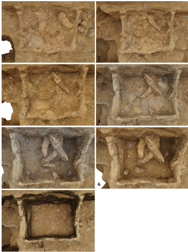
Figure 2. Sequence of seven 3D-models showing the progress of excavation. The sequence starts with the top layers of soil from the left to the right. The models are numbered from 1-7 in the bottom left corner.

display the room and the bin would illustrate the tangible and intimate connection of these two spaces. Early in the excavation it was clear that at the top of the infill layer there was a large amount of well-preserved animal bones compared to the condition of faunal remains previously discovered in this particular house. Excavators recognized that this context provided an opportunity for a distinctive case study of how this documentation technique can be used to record spatial distributions of faunal remains in infill contexts.