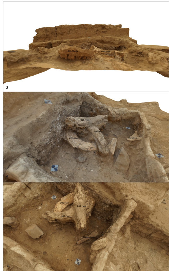
Figure 3. Close-up snapshots from the models. The numbers in the top left corner indicate from which models they were taken in figure 2.

Mapping the precise contextual locations of faunal remains by hand is Sisyphean in terms of work effort. As illustrated in this case study, 3D-modeling enables re-assessment of context because any notes and maps detailing the recovery of faunal specimens can be reconsidered by returning to the model where the remains are documented in high resolution. Digital approaches to archaeological documentation can potentially enable more detailed examination of spatial patterning even after remains have been removed from their excavation contexts. For example, as reported in this study, spatial patterning of