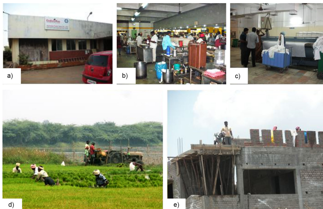
Fig. 1. Pictures of workplaces: a) outside view of cookie factory, b) food serving area of the canteen, c) drying machines at the laundry, d) agricultural field, e) roof of construction building.

The canteen has different sections that prepare western and south Indian food. In the raw material receiving and