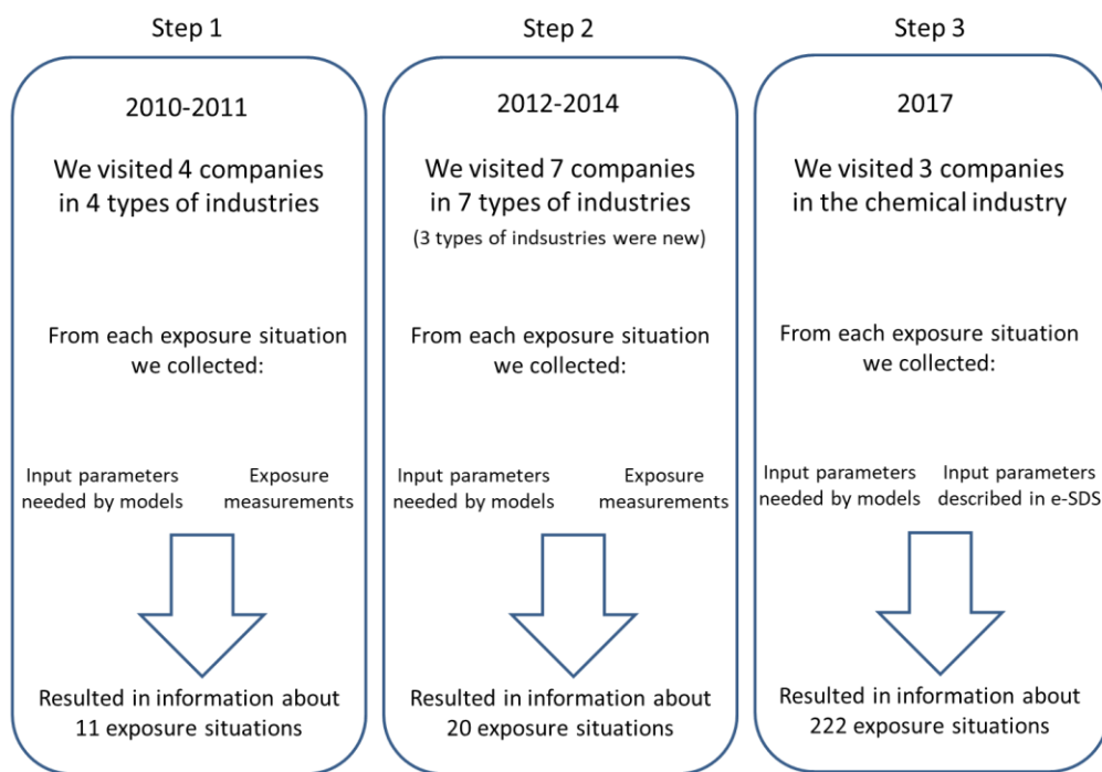
Figure 2 Information about the collection of data included in the 4 studies