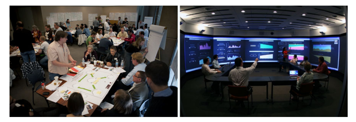
Fig. 1 Sustainability scientists working with city representatives, businesses, non-profit organizations and citizens on systemic visions and strategies for urban sustainability in Phoenix, Arizona [ left at City of Phoenix City Hall; right at Arizona State University's Decision Theater]

Perhaps the most critical component of a transition to sustainability will be society's ability to facilitate sociotechnical change—shifts in the configuration of institutions, techniques and artifacts as well as the rules, practices and norms that guide the development and use of technologies (Smith et al. 2005). This research priority is also essential to identifying the obstacles and opportunities to shift to sustainable socio-technical pathways.