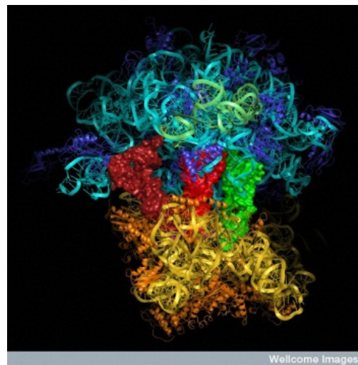
Illustration 1. http://nobelprize.org/mediaplayer/index.php?id=1207

In molecular protein biology after the crystallization process is successfully done the measured density between electrons are modeled into pictures in order to grasp the where the atoms are sitting in the molecule (Brändén & Tooze, 2009). (illustration 2)