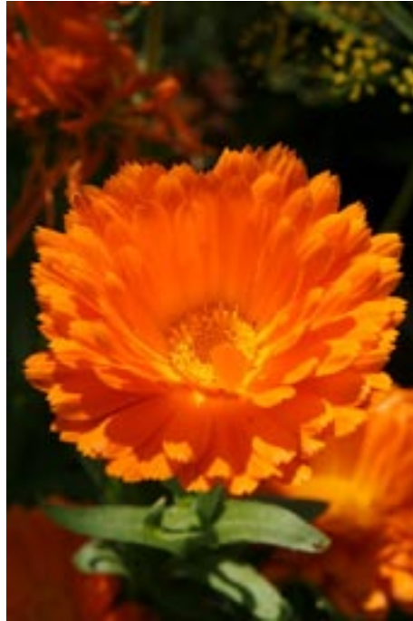
After confessing ones sins, the absolution came in a little white envelope containing Marigold seeds.

As the three boys confessed their sins, they also acted out the ritual. However, their con-