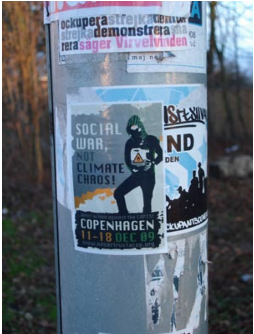
For protest groups an important media technology was stickers in public places all over the Øresund region, as on this lamp-post in Lund.