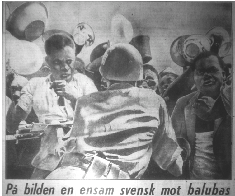
Image 9. The text reads: 'In the picture a lone Swede against Balubas' Aftonbladet , 6/12/1961.

In the picture a lone Swede against Balubas [sic]. The hateful mood in the Baluba camp is now at boiling point and the few Swedish UN soldiers, one [of whom can] here be seen scuffling with a bunch of Balubas, can only with the utmost difficulty control the situation. It is now feared that the revengeful refugees, who have armed themselves with axes, spears, long jungle knives and bicycle chains, will break out of the camp. Should they succeed the real bloodbath awaits. In the camp are around 40,000 Balubas and they are guarded by only 67 Swedish UN soldiers. 438