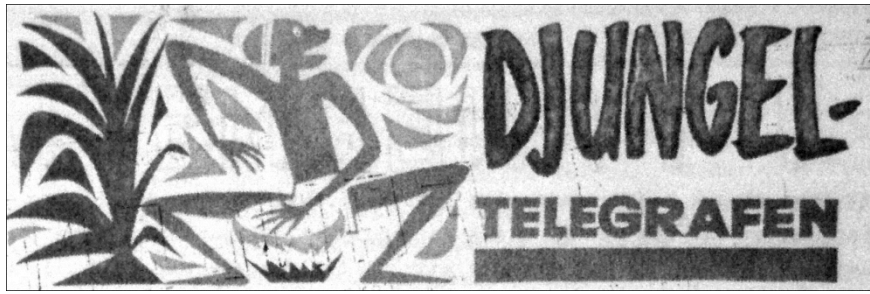
Image 11. Djungeltelegrafens embellished title.

Far more explicit than expressions of biological racism was the hierarchy between cultures. As argued primarily in Chapters 2 and 7, Swedish society was thought of as superior to all others, not just the Congolese but in many respects those throughout the world.