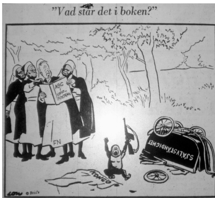
Image 3. Headline: 'What does the book say?' Book title: 'Fostering ABC'; pram: 'Independence', in Dagens Nyheter , 24/7/1960.

The troublesome situation for the Congo itself received less media attention. The main objective seems to have been ensuring peace and security and preventing a 'new Korea', rather than helping the Congo to attain independence or protect the Congolese people. Humanitarian concerns were discussed in the press, but the suffering of the Congolese people was mostly overshadowed by international politics. The media had little confidence in the Congo and its people. The situation there, it was felt, needed to be solved by UN involvement, and the debate never focused on whether the Congo needed guidance or not, but rather how and by whom it should be carried out.