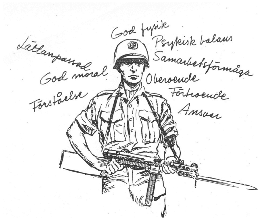
Image 4. The Swedish UN soldier and his expected skills. (From left to right shoulder): Understanding, Ethical, Easily adaptable, Good physique, Mental balance, Ability to cooperate, Independent, Inspiring confidence, Responsibility. In Anvisningar för svensk trupps uppträdande under tropiska förhållanden , Arméstaben, 1960, p. 9.

The job of the Homeland Defender was to protect the homeland. This, of course, included the protection of civilians (one's family and friends). The portrayal of the civilians – or the 'natives', as they were consistently termed – was problematic from the outset. Without any reference to the political landscape, different tribal structures, traditional rivalries or the history of the Congo, the natives appeared to form a single Congolese population. As such they were entitled to protection by the UN, but at the same time were seen as the problem. A separate chapter dealt with how to control crowds, with different techniques from escorting and observing all the way up to, as a last