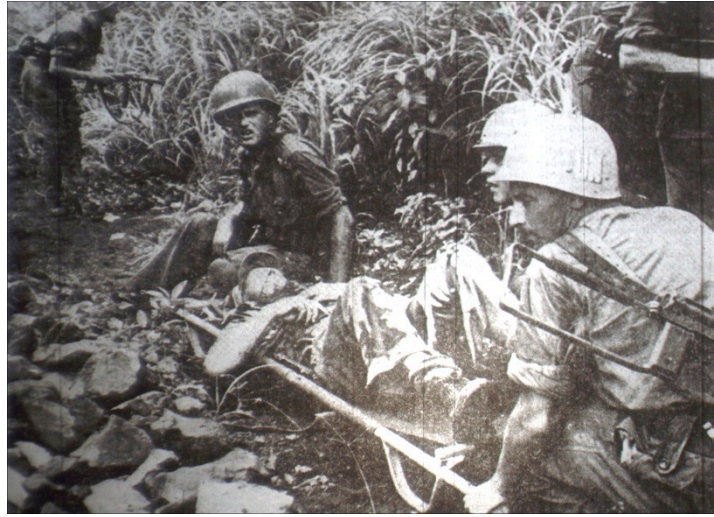
Image 5. Swedish UN soldiers taking care of a wounded comrade. Note the two guarding soldiers in the background. ( Dagens Nyheter , 21/1/1961)

On the political level, none of the studied newspapers suggested a withdrawal of troops from the Congo as a consequence of the events. On the contrary, they supported the continuation of the mission. Situations like this were just what one should expect along the way, Dagens Nyheter wrote on the subject on 16 January: