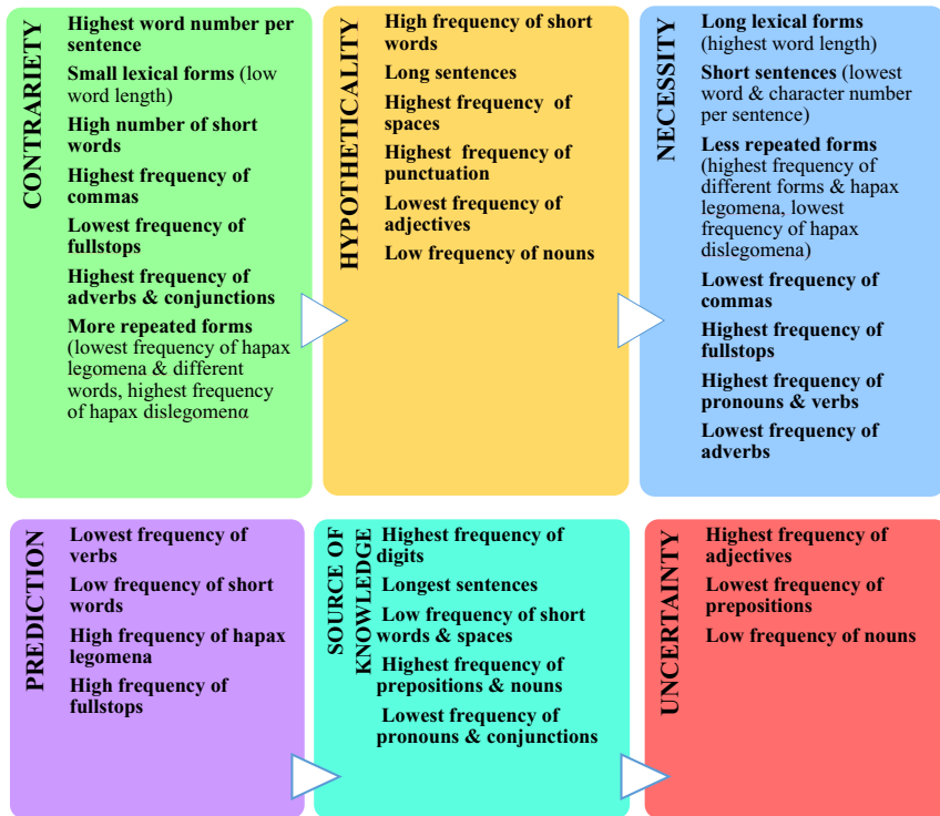
Figure 1: The most important characteristics of the six types of categories in BBC.

In Figure 1, we provide an overview of the stanced sentences in BBC. We summarise the important clues of differentiation among the six stance categories in Figure 1: