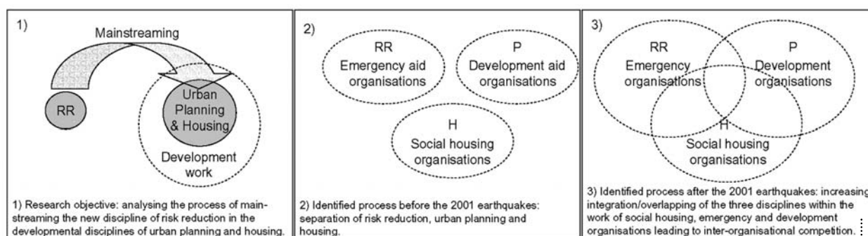
Fig 1. Process of mainstreaming risk reduction in El Salvador. RR = Risk reduction, H = Housing, P = Urban Planning.

seem to have built up more lasting alliances aided by the fact that these alliances provided them with further access to financial resources.