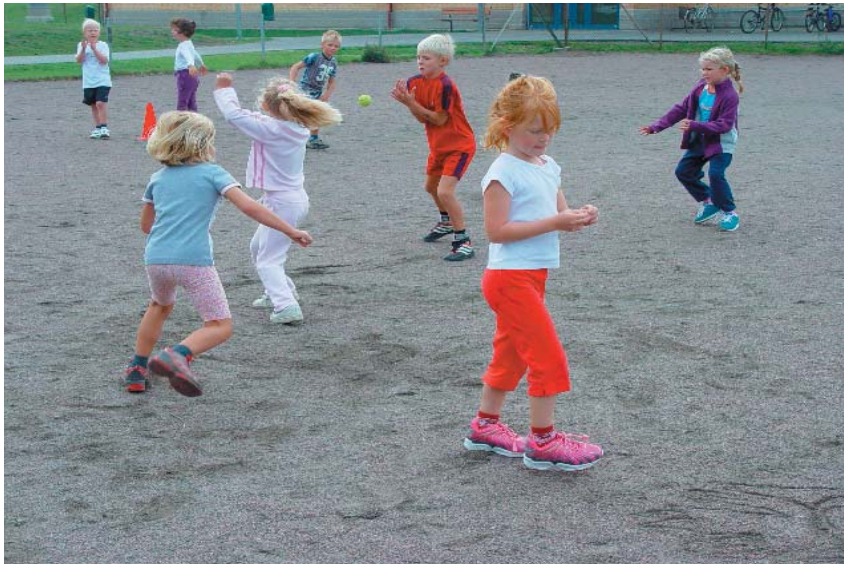
Figure 5. All children in grades 1 and 2 were invited and time spent in physical education classes was increased from 1–2 lessons a week to one lesson every school day.

The ideas behind the POP study have spread and over a thousand Swedish schools have now joined our network aiming to create health-related schools ( www.bunkeflomodellen.com ). Collaboration with other research groups in Australia, Denmark and Norway, also evaluating the effect of physical activity in children, has flourished. Our work has also received awards from several national and international institutions in the bone field. Following the inception of our study, daily physical education classes have been introduced in Norwegian schools and a similar resolution has been passed by the Swedish government. And the work continues.