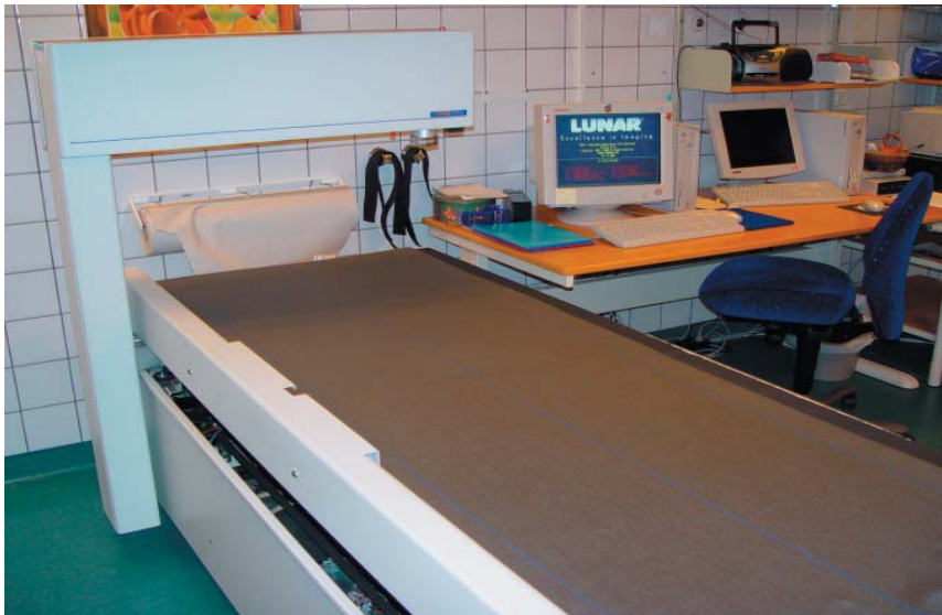
Figure 2. Dual energy X-ray absorptiometri (DXA).

Quantitative ultrasound uses the absorption of a sound signal expressed as broadband ultrasound attenuation (BUA, dB/MHz), often described as reflecting the density of the bone whereas the speed of sound (SOS, m/s) is often described as reflecting the architecture and elasticity of the bone. The calcaneus is the bone most often used for these measurements, as only skeletal parts not covered by extensive soft tissue can be used. The in vivo precision of OUS is 0.3%–1.5%. The advantage of this method is that it is radiation-free and cheap, but one disadvantage is that it does not discriminate between trabecular and cortical bone 160,188 .