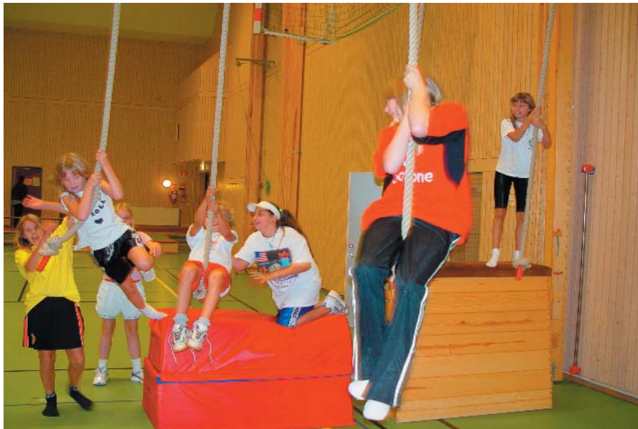
Figure 6. Participants enjoying intervention activities.

of the total physical activity at baseline and at follow-up, with changes in the bone parameters during the study period. A p-value of < 0.05 was considered as a statistically significant difference.