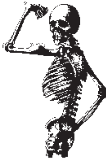
Figure 4. Bone strength is not only decided by the amount of bone mineral alone, but also depends on structural characteristics such as size, shape and three-dimensional architecture.

section modulus describes the resistance to bending and is calculated as the ratio of CSMI to half the periosteal width. The estimation of moments of inertia and the section modulus represents the geometrical contribution of bone strength and is independent of the material properties of the bone tissue 180 .