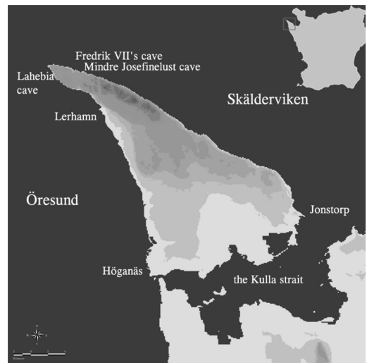
Fig. 1. The post-glacial island with key names mentioned in the text.

Over the millennia the geomorphologic features in the peninsula underwent considerable changes. 1 During the deglaciation around 16,000 BP the marine limit was as high as 85 metres over today's sea level. Kullaberg emerged as a small arctic island in the Kattegatt Sea. In a small fen, a bone of a polar bear was found, first described by Sven Nilsson (1860), and later analysed and radio-carbon-dated to 14,500 BP (Berglund et al. 1992). Due to the land upheaval a larger peninsula was formed 12,000 BP and the shore level was situated 10 metres below the present