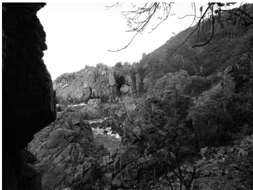
Fig. 4. The view to the east from Fredrik VII's cave to the Josefinelust cave.

It is quite impossible, due to steep slopes, ravines, and broken terrain, to climb down the cliffs, or to walk along the water's edge. At certain spots you can climb down to visit some of the 20 caves that are situated around Kullaberg, although, several of them can only