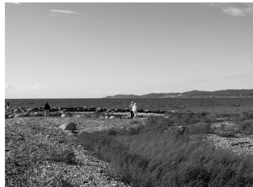
Fig. 5. Looking back at Kullen when walking to the south. (Photo Kristina Jennbert 2005).

It is taken for granted that the caves were used during the Stone Age. However, archaeological excavations in four of them yielded only very few finds from the Stone Age, but more finds from the Iron Age and modern times. The Lahebia cave is situated on the southern side of the outermost point, near today's water level. The cave is rather deep inside a cliff. The opening faces the west. In the summer the sun shines into the cave just a few hours in the late afternoon. A small amount of flint waste and medieval pottery, iron nails and animal bones were found in the Lahebia cave. The cave was mainly used during the Late Iron Age and post-medieval time. In Fredrik VII's cave stone artefacts and animal bones suggest that people could have visited the cave during the Late Mesolithic. Both Fredrik VII's cave and the Mindre Josefinelust cave are exposed towards the inner part of Skälderviken, and turned to small bays surrounded by rocky mountains (fig. 4). In a few hours in the morning the sun reaches the caves. Later in the day they are placed in the shadow of the mountain. The artefacts in the