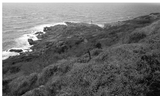
Fig. 3. View from the outermost point at Kullen.

Thus, the landscape itself and the sites in the Kullen district could be a good example of how to theorize about archaeological terminology, and how to break down the dichotomies of Mesolithic and Neolithic and the established polarization of subsistence strategies