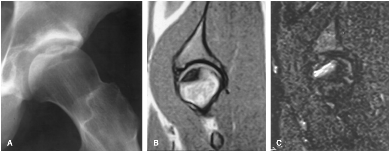
Fig. 3. Patient 1. A) Lauenstein view of the left hip at age 18. B) and C). MR at age 22. T1-weighted sagittal view in (B) shows low signal intensity, while the STIR sequence (C) shows marked edema in and around the lesion.

a bony body within the excavation dislocated slightly at a follow-up examination, indicating that the bony body was or had become loose (Fig. 1).