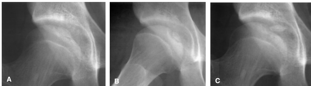
Fig. 2. Patient 5. OD after trauma. A) A.p. view at age 16. B) Lauenstein view at age 16. The bony fragment is better outlined in this view compared to the a.p. view. C) At age 18, the bony body has dislocated from its position at the bottom of the lesion.

In all 15 patients the lesion was seen as an excavation of the femoral head, in 4 best seen with the Lauenstein view (Figs 1 and 2). The lesions measured from 5 mm in diameter up to 30 × 15 mm in one view. Bony bodies were seen in these excavated lesions in 9 patients. Loose bodies were seen on plain radiographs outside the lesion in 2 patients. These bodies were verified with CT. In 1 patient