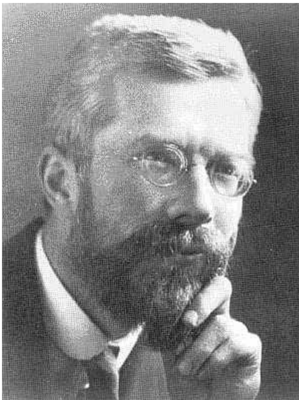
Figure 4: Sir Ronald Aylmer Fisher (1890–1962)

Fisher's exact test is used to determine if there are non-random associations between two categorical variables, often illustrated in a two by two contingency table. It is an alternative to the \chi^2 test, but returns exact one-tailed and two-tailed p -values for a given frequency table, while the \chi^2 gives an approximation. It is recommended that Fisher's test be used if the expected number in one cell in a two by two table is less than five.