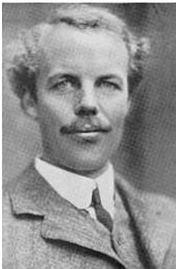
Figure 2: Arthur Cecil Pigou (1877–1959)

A decreased QoL with impaired experience of sex life (as in papers I–III) may mirror ED. This in turn may be an explanation why the dimension “experience of sex life” is significantly related to death in the Cox regression analysis in paper III. AMI and CABG patients differed from controls at one-month and one-year assessment in this dimension of QoL.