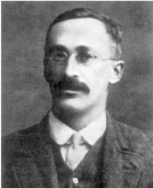
Figure 3: William Sealey Gossett (1876-1937)

A combination of modesty and extreme caution is recommended when discussing statistical truths. Modesty because there are several potential methods to use in the analysis of a material, and caution because statistical truths simply are no truths.