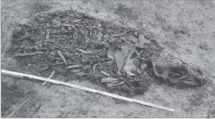
Fig. 3. The bear-grave from Sörviken, Stensele Parish, Lappland.

they belong to a later time period, after the reindeer-based economy had begun and up to modern time (Iregren 1985; Zachrisson 1985; Schanche 2000:271f).