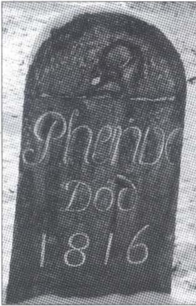
Fig. 5. Stone marker for "Phenix, died 1816", Flyinge stud farm, Scania.

nineteenth century. Today there are only three stones left of the original sixteen stones with the name and year of death of the buried stallions (Fig. 5). The tradition to bury stud horses in Flyinge can be traced back to the early nineteenth century (oral comm. Jana Zupanc och Elisabeth Iregren).