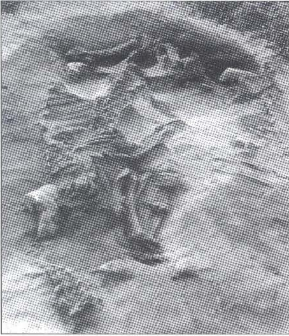
Fig. 2. The horse-grave from Ölands Skogsby, Torslunda Parish, Öland. A lower jaw is visible in the foreground.

discovered. The grave contained a man about fifty years in age, as well as a stallion that was three or four years old. The horse was placed next to the man's wooden chest, in a separate deposition. The horse lay on its side with its back toward the man's feet and its head in the south. Two ^{14}\text{C} dates from the horse's teeth gave a calibrated 1sigma value of AD 670-780 (Holmquist-Olausson and Göthnerström 1998:107; Fennö Muyingo 2000:9).