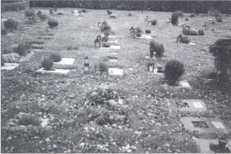
Fig. 4. The animal burial place at Pålshö in Helsingborg. The picture was taken on All Saints' Day, and several graves are decorated with grave-lights.

breeding, animal experiments, or the transplanting of animal organs in humans. Thus there is reason to discuss the attitudes of people toward animals, and to examine the relation between people and animals in a longer time perspective.