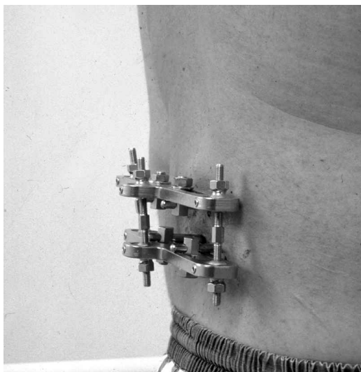
Figure 4. External pedicular fixation ad modum Magerl.

better compared to 33% of the non-surgically treated patients. There was however no significant difference regarding return to work. Three fusion techniques were used, posterior, uninstrumented and instrumented fusion, and 360° fusion. The two more demanding techniques (instrumented and 360° fusion) consumed significantly more resources with the respect to operation time, blood transfusions and hospitalisation time and the early complication rate was 6.16 and 31 % in the respective groups. Thus, an RCT has proven the scientific value of fusion surgery for chronic low back pain but the results reported demonstrate that there are pronounced margins for improvement.