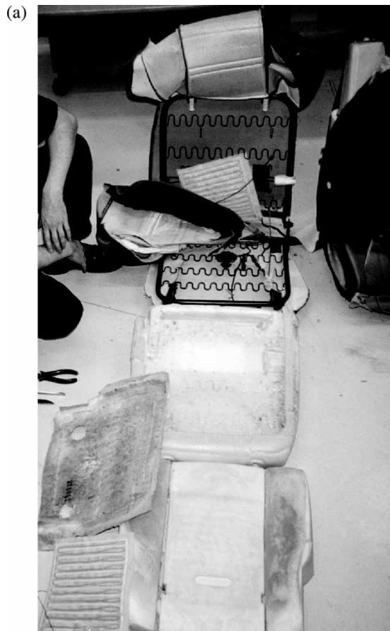
Figure 2. Car seats: (a) simple old seat (1996); seat foam not integrated in the frame; zipper to remove the outer material without cutting; no electric devices; (b) complex newer seat (produced today); to the left : back panel embedded in the seat frame, to the right : numerous electric components.

Furthermore, the development of handling and lifting tools for easier removal of car seats is needed. In the long run, initiatives should be taken to study both positive and negative consequences of an increased level of recycling of existing products in terms of physical workload. The group wanted continued workshop meetings 1–2 times per year as well as establishing a network of design engineers and dismantlers via their branch representatives. The principal design engineer also