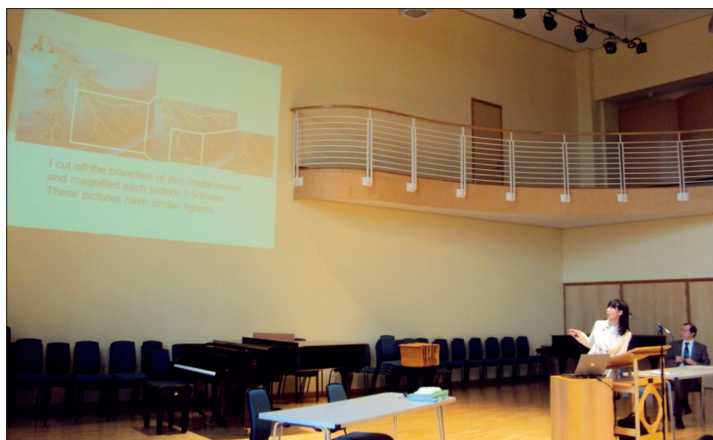
The conference gives students experience in presenting their work.

With more than 100 visiting students and a similar number from the home team in the audience at times, there was a won-