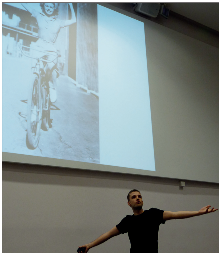
One of the participants in action at the lecture competition.