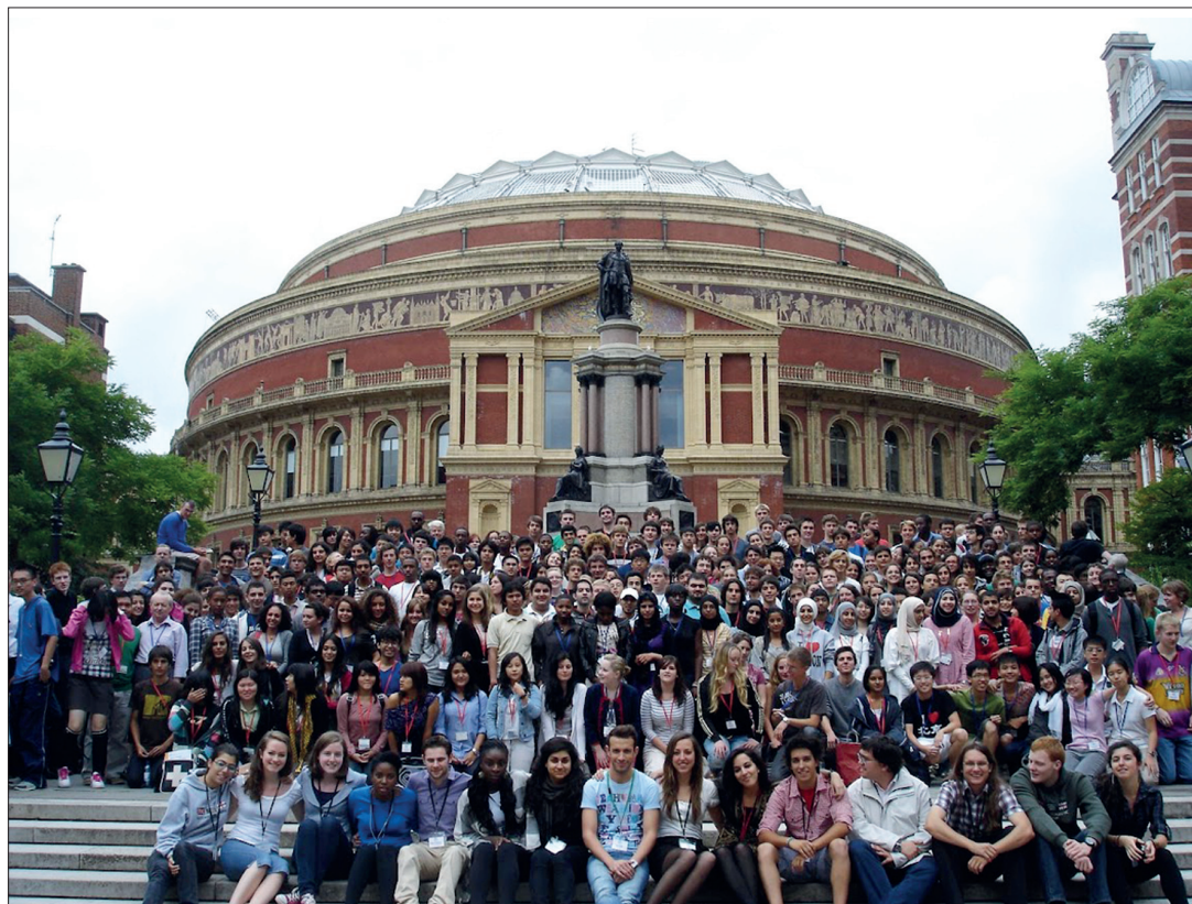
Young scientists from the London International Youth Science Forum on the steps of the Albert Hall.

The London International Youth Science Forum (LIYSF) offers a unique opportunity to participate in an international event that attracts more than 350 of the world's leading young scientists, aged 17–21, from more than 50 participating countries. They include the top prize-winners from the European Union Contest for Young Scientists and the Gold Crest award winners at the Big Bang Fair.