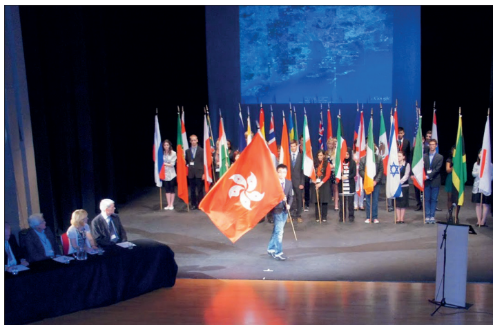
The opening ceremony of the LIYSF celebrates its diversity.