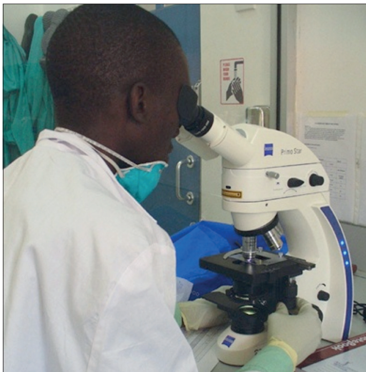
Portable optical tuberculosis diagnosis is an example of how optical technologies are being used in medicine.

The idea needs to be proposed by an executive of the UN Educational, Scientific and Cultural Organization (UNESCO) and would then be approved at a forthcoming UN or UNESCO General Assembly meeting.