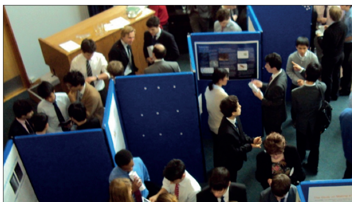
Students enjoy meeting with their peers at the conference.