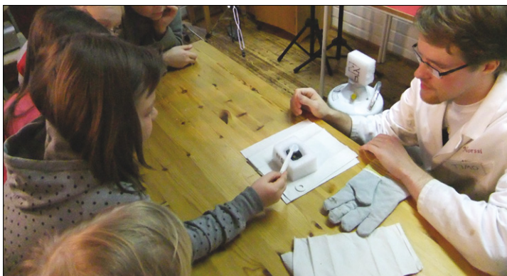
The magnet hovers over a cooled superconductor and won't budge.

Mikkeli. The show is free of charge to the schools and has received funding from the Finnish Physical Society. The roadshow has been organized