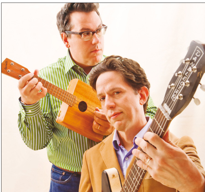
They Might Be Giants have produced a science-themed album.

While some songs are simply repetitious and reinforce a basic scientific principle, such as the difference between speed and velocity, others are more demanding of young listeners. 'Meet the elements' is a quick tour of the periodic table, which cranks out properties for more than a dozen common elements. Likewise,