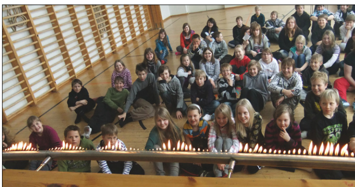
A sine wave of sound modulates pressure in a Rubens' tube.

The ‘Seven Wonders of Physics’ roadshow was invited this year to four elementary schools (ages 7–12). The size of schools ranged from 24 pupils at Savio, Laukaa, to 137 at Haukivuori,