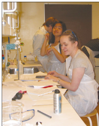
The first day: helping aliens to search for water on a visit to Earth.

tal tasks in this test—revealed to the mentors the day before the competition—included different ways to determine various properties of water, including surface tension, viscosity and hardness,