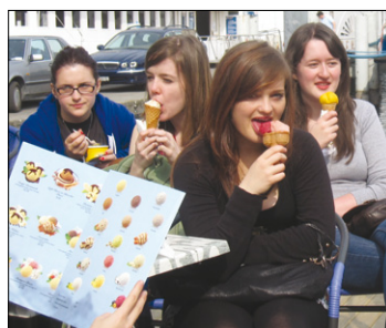
The morning by Lake Geneva.