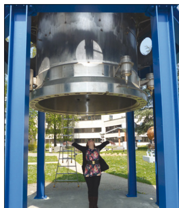
Big European Bubble Chamber.

I find physics truly fascinating, and I'm hoping to study it at university. For me, visiting a place like this really has put things in perspective. I knew before the trip that particle physics was the