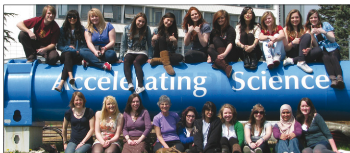
The group enjoy the sunshine outside at CERN.

The guides had all worked on different projects at CERN, and their passion and enthusiasm for their work was contagious. We