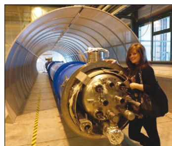
A close-up of a segment.

were shown the manufacture of the superconducting magnets and saw real components and mechanisms involved in making the LHC. We visited the Computer Centre (a personal highlight) and the LHCb.