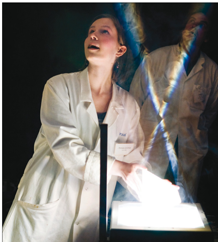
Rainbows are reflected from the prism when illuminated by a projector.