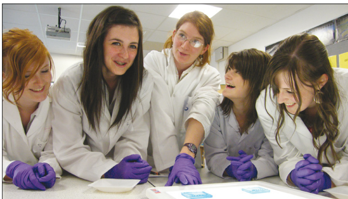
Researchers can enrich curriculum delivery and boost student motivation.

Teachers use the Researchers in Residence scheme to engage and motivate their students, to get them thinking seriously about physics-related careers and to make links with their local university. The amount of time that teachers have to put in is minimal. Perhaps the biggest benefit of inviting a researcher into your school is that they provide a young and energetic role model for your students. Not just any role model; someone who is actively and enthusiastically learning about physics. The scheme offers 24 hours of teacher and student classroom support from some of the country's leading researchers who can enrich curriculum delivery and bring subjects to life with imaginative projects and interactive exercises. Hosting a researcher can boost student motivation, enhance curriculum delivery, improve grades