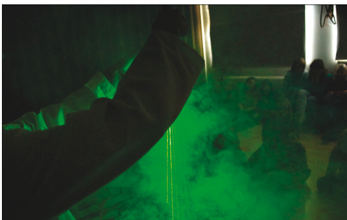
One laser beam turns into many.