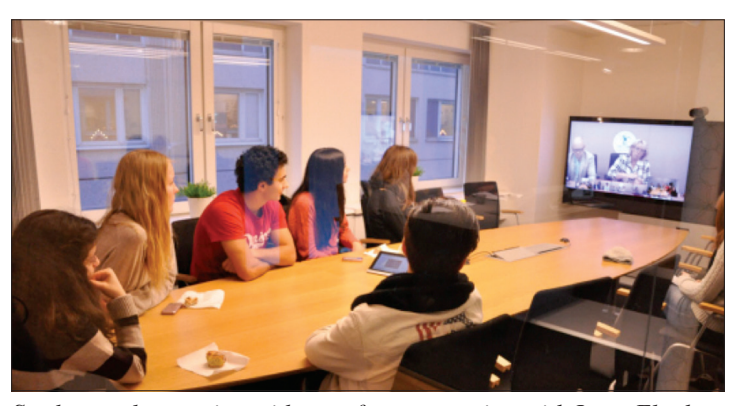
Students take part in a videoconference session with Lena Ek, the Swedish minister for the environment.

The session ran on the UN videoconference system, while the live session was referred to in a joint Google document. In addi-