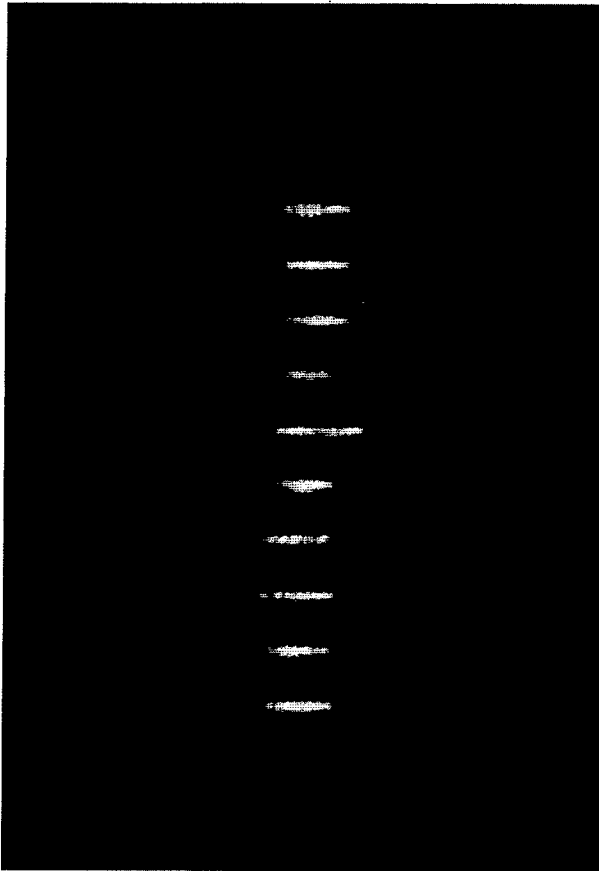
FIG. 2. Photograph of trapped particles in the standing-wave pattern.

ticle is high. Still the residual concentration of particles in the water cell is very low resulting in a small probability for collecting many particles in the trap during the experiment. Often, particles accumulate in more than one trap. Many of the traps may be emptied by lowering the acoustic power, thereby lowering the trapping force below the trapping threshold in the regions outside the focus.